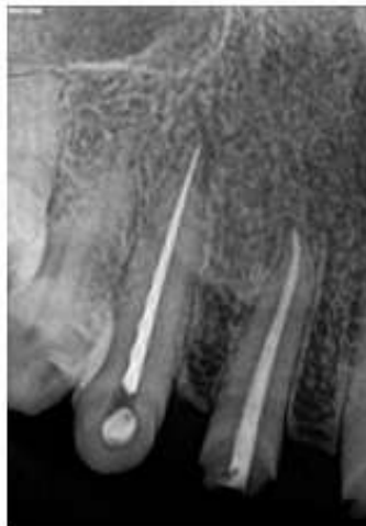
Figure 1: Pre-operative radiograph

IRS system was then employed for retrieval. Microtube of the IRS system was inserted into the canal with the long part of its beveled end oriented to the wall to “scoop up” the head of the separated instrument and guide it into the microtube. Success in guiding the head of the separated instrument into the microtube was achieved after few attempts. Same color-coded screw wedge was then inserted and slid internally through the microtube’s length until it contacted the separated instrument. The separated instrument was engaged by gently turning the screw wedge handle counterclockwise. A few degrees of rotation served to tighten, wedge and often displace the head of the separated instrument through the microtube window. The separated instrument was removed by rotating the microtube and screw wedge assembly out of the canal in counterclockwise . The microtube and the screw wedge were taken out of the canal along with the separated instrument [Fig 4 and 5].