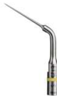
Figure 2: ET25 ultrasonic tips (ACTEON)