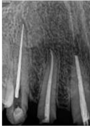
Figure 3: After ultrasonic troughing