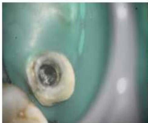
Figure 7: Clinical view after file retrieval under DOM