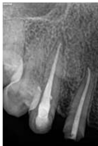
Figure 10: Post operative radiograph