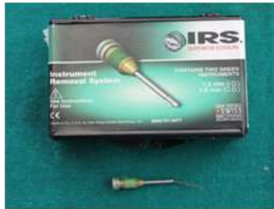
Figure 4: IRS kit