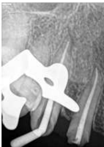
Figure 9: Master cone radiograph