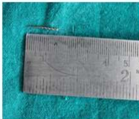
Figure 8: Fractured fragment