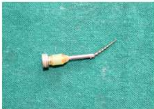
Figure 5: Separated file retrieved with IRS