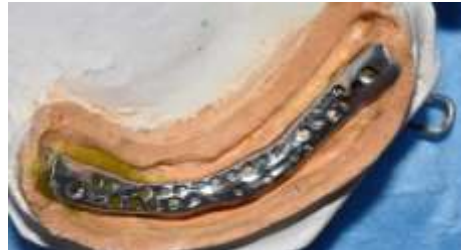
Fig. 5:- Metal frame work on master cast.