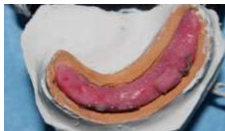
Fig.6:- Modified mandibular denture base.