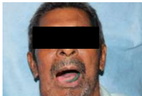
Fig. 7:- Recording neutral zone using admix.