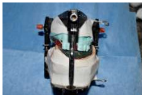
Fig. 8:- Neutral zone record mounted on an articulator.