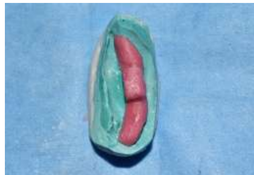
Fig. 3:- Special tray for segmented mandibular arch.