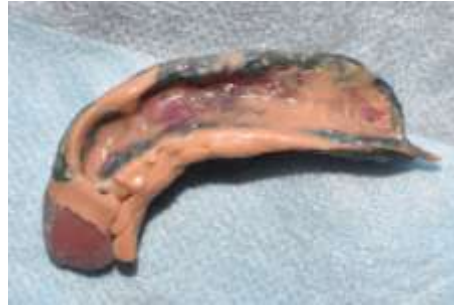
Fig. 4:- Final impression.