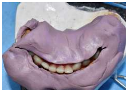
Fig. 10:- Teeth were arranged with in the neutral zone.