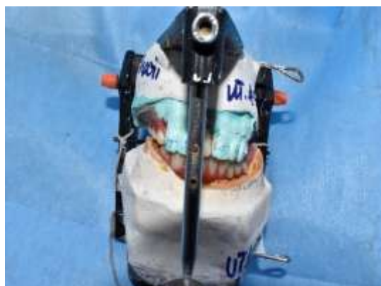
Fig. 11:- After complete teeth arrangement.