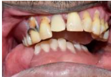
Fig. 13 B:- Intraoral view of final prosthesis.