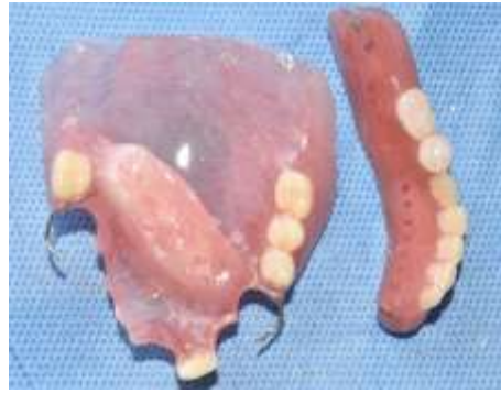
Fig. 13 A:- Final prosthesis.