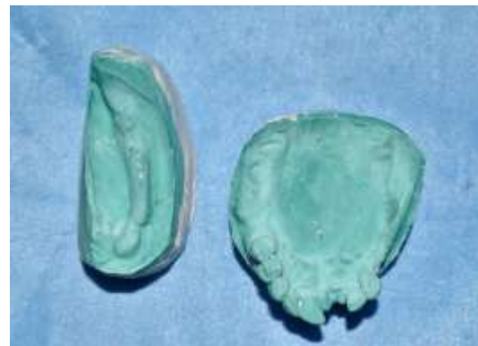
Fig. 2:- Diagnostic cast.