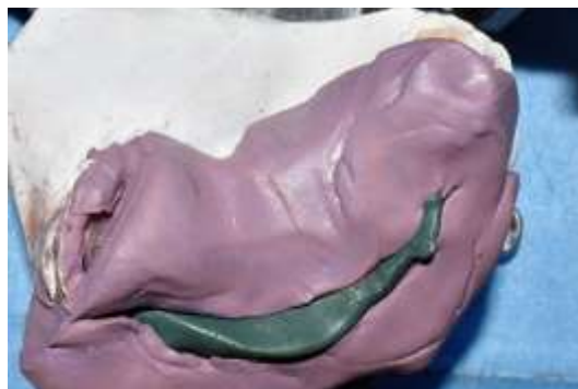
Fig. 9:- Silicone putty index.