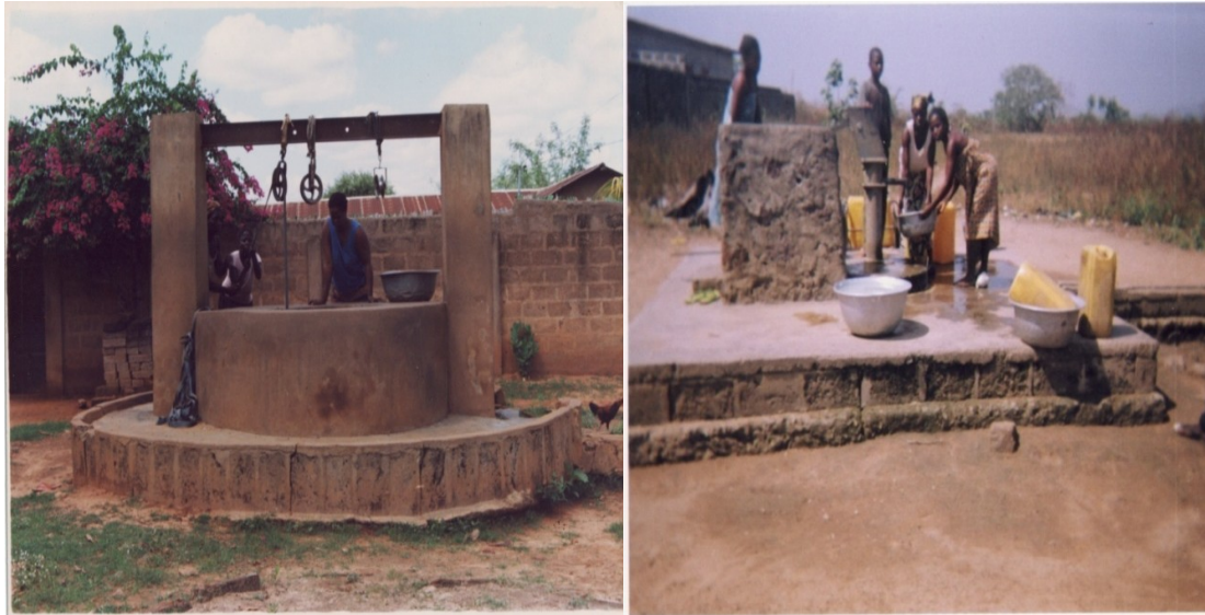
Plate 2:- Modern large-diameter well and human-powered drilling in the town of Glazoué.

There are also some modern large-diameter wells such as the one in Plate 2 which shows a modern large-diameter well and a human-powered borehole from the town of Glazoué.