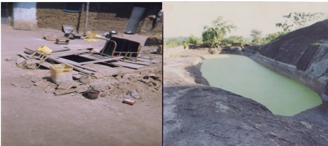
Plate 1:- Traditional wells of the municipality and Lake of the municipality of Glazoué

The wells observed in the locality are no different from those found elsewhere. In general, they are characterized by an almost total absence of coating or lower coverage. They sometimes have a cement coping 0.5 to 1 m high above the ground with a diameter varying between 1.5 and 2.5 m. The depth of these wells is between 6 and 15 m depending on the villages or city districts. The negligible or shallower depth of the wells in the locality is explained by the rocky outcrops encountered throughout the locality. Plate 1 respectfully presents a traditional well and a body of water in the commune of Glazoué.