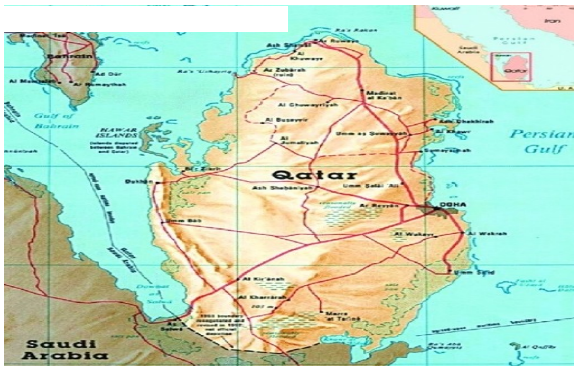
Figure 1:- Map of Qatar