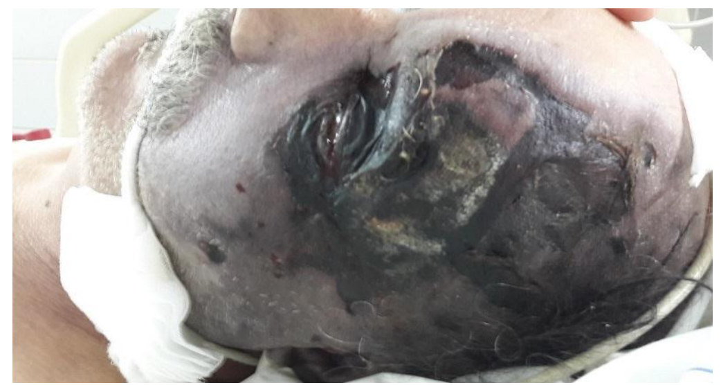
Figure 1: Necrosis of the hemiface and left eyeball

Face ischemia is a very rare consequence of carotid artery stenosis. his finding must always be reminiscent of a carotid pathology.