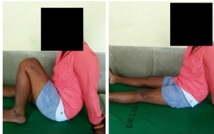
Flexion and extension at knee joint