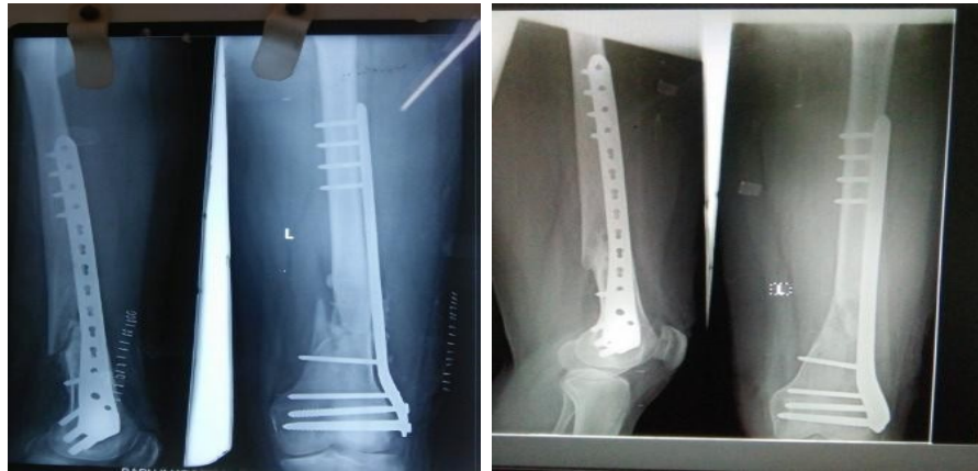
Fig 5:- Three months and one year end follow up xrays.

Three months and one year end follow up xrays.