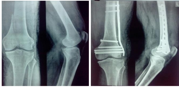
Fig 2:- Pre and post opx-rays.