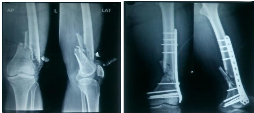
Fig 3:- Pre and post opx-rays.