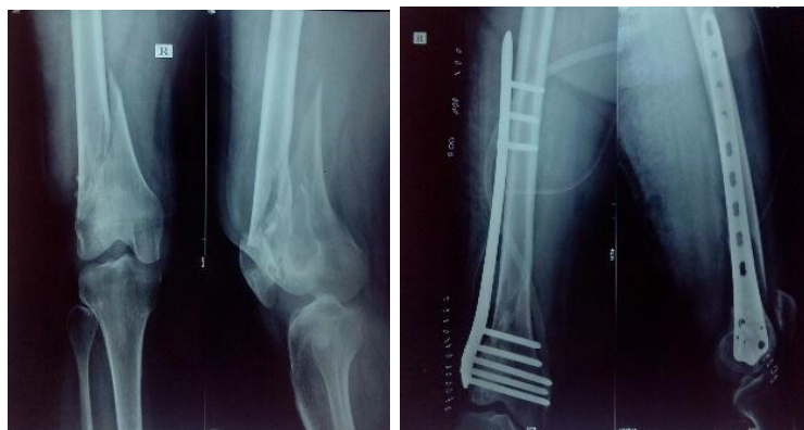
Fig 1:- Pre and post op xrays.