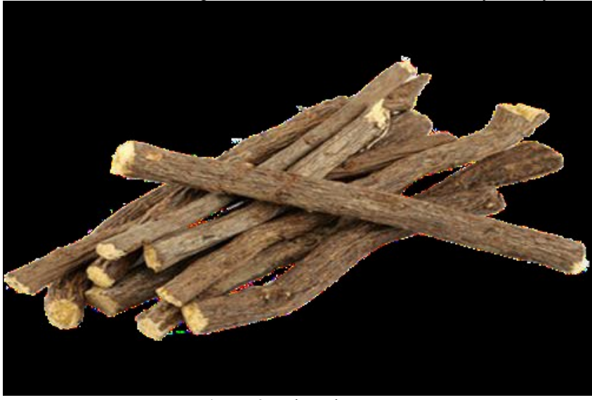
Figure 3:- Liquorice root.

Liquorice root (rhizome) commercial extracts of glycyrrhizin in ammonium salt and G. glabra alcoholic extract which produced of four active ingredients: hydroglia aspirin C and dehydrogol aspirin D, glycaemia coumarin glycerin. Other ingredients of Liquorice are flavonoids, coumrins, amino acids, esteroles, Liquiritin, formononetin, starch, Saccharides, resin, oil essences, and saponins. This herb is anti-inflammatory activity