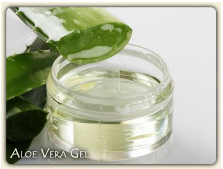
Figure 2:- Aloe Vera Gel.