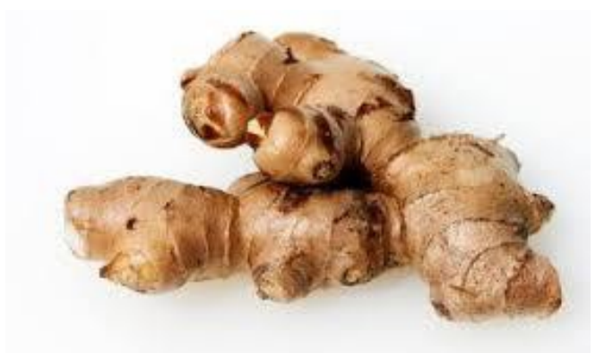
Figure 4:- Ginger Rhizome.