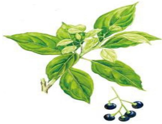
Figure 6:- Cinnamomum Camphora

Family: Lauraceae. Chemical constituents: camphor, linalool, safrole, nerolidol, borneol. Parts used: wood and root.