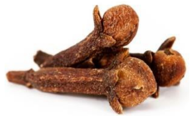
Figure 5:- Clove buds.

Extraction of clove buds can be used aqueous and organic solvent like ethanol. Chemical constituents of clove: Eugenol, methyl salicylate, acetyeugenol, pinene, vanillin. Eugenol mainly shows the analgesic activity