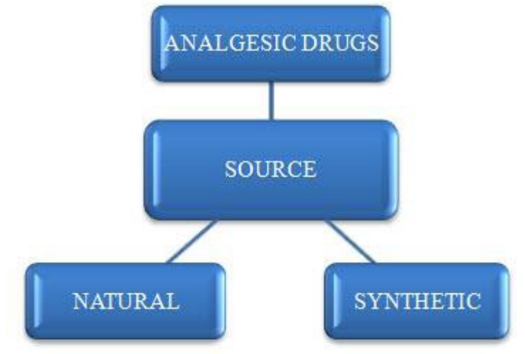
Figure 1:- Source of analgesic drugs.

Herb containing flavonoids performed many effects by blocking the cyclooxigenase enzyme, tannins. The chemical constitute iridoid and flavonoid in extracts of herb is responsible for analgesic activity. Monoterpene ingredients linalool presence in cinnamon extracts that act on pain receptors and produce an analgesic action. Phenols like eugenol block calcium from into the cell and thus loss the pain sensation. In rhizome ginger, gengerol is active chemical constituent it has strong activity to inhibiting prostaglandins. And produced mechanisms that lower vascular permeability and induce of pain mediators, is the main analgesic agent of ginger herb. Analgesic activity of ziziphora clinopodioiedes obtained from the Lamiaceae family that produced analgesic activity by inhibiting acid and prostaglandins synthesis and arachidonic affecting opioids (Zafar, 2010).