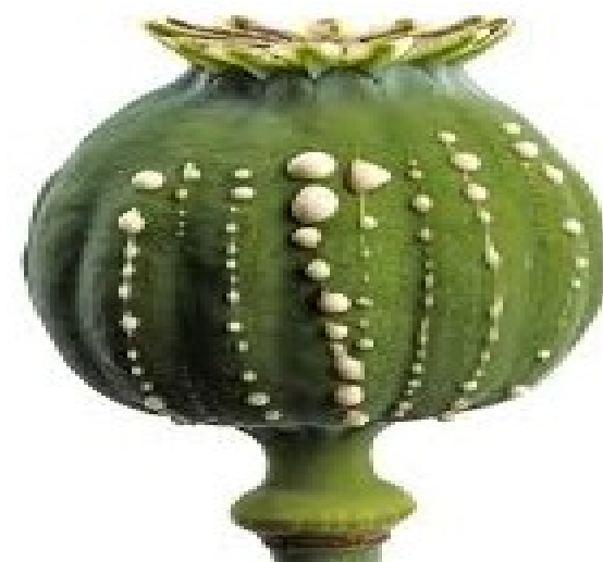
Figure 8:- Opium Poppy.

Traditional Indian system of Medicine-Ayurveda has used opium/tincture opium for several elements. These include conjunctivitis, analgesia, relief of pain for biliary and renal colic, anti-diarrhoeal, for common cold and cough and insomnia.