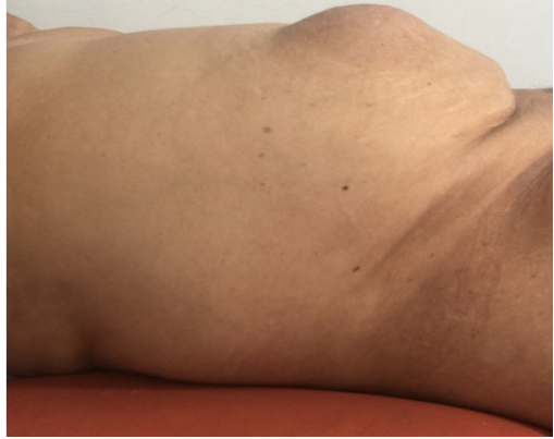
Figure 2:- Clinical image of the abdomino-pelvic mass.