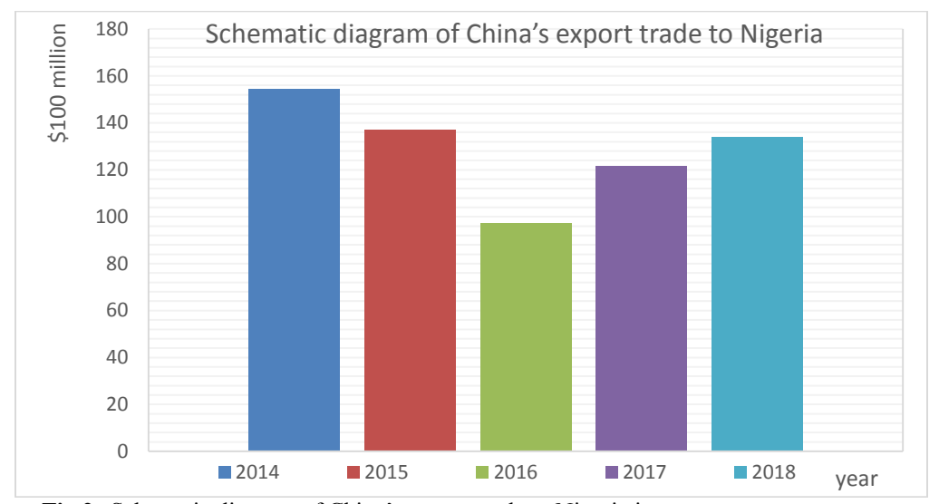
Fig 2:-Schematic diagram of China's export trade to Nigeria in recent years