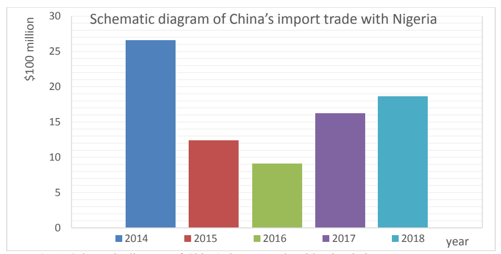
Fig 1:-Schematic diagram of China's import trade with Nigeria in recent years