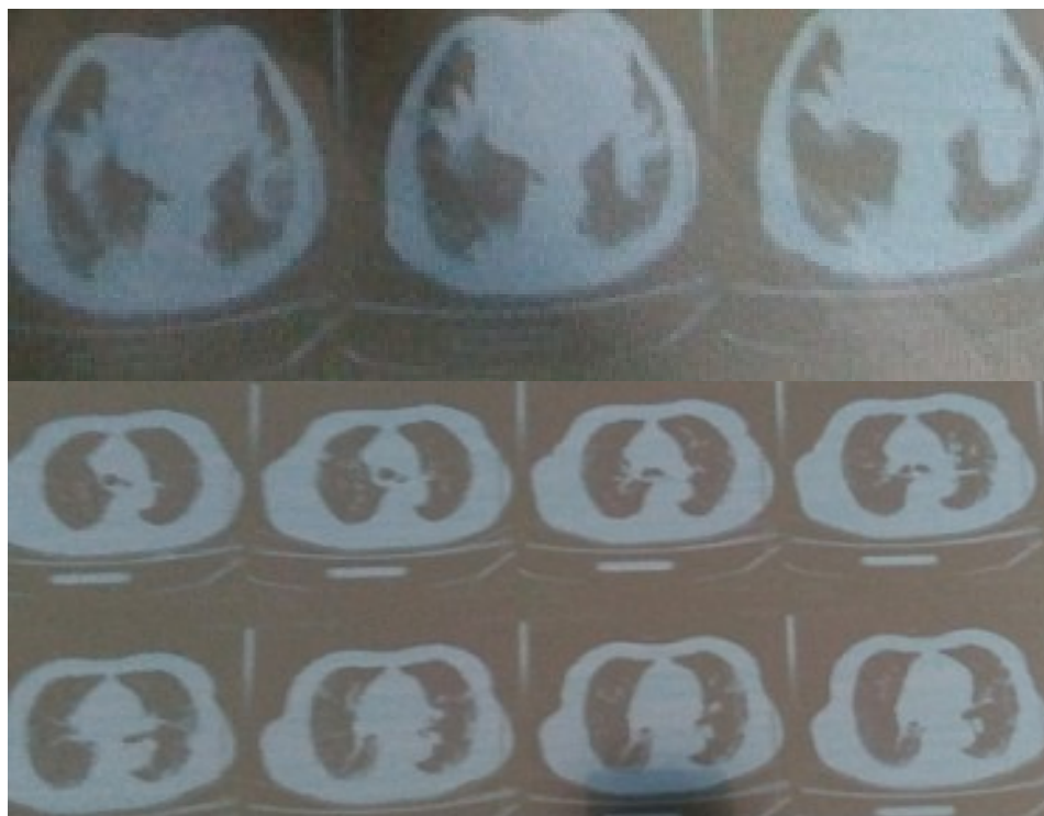
Figure 2:- Thoracic computed tomography at admission.