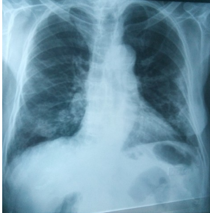
Figure 1:- Chest x-ray at admission.