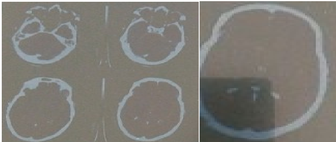
Figure 4:- Cerebral computed tomography showing cerebral venous thrombosis.