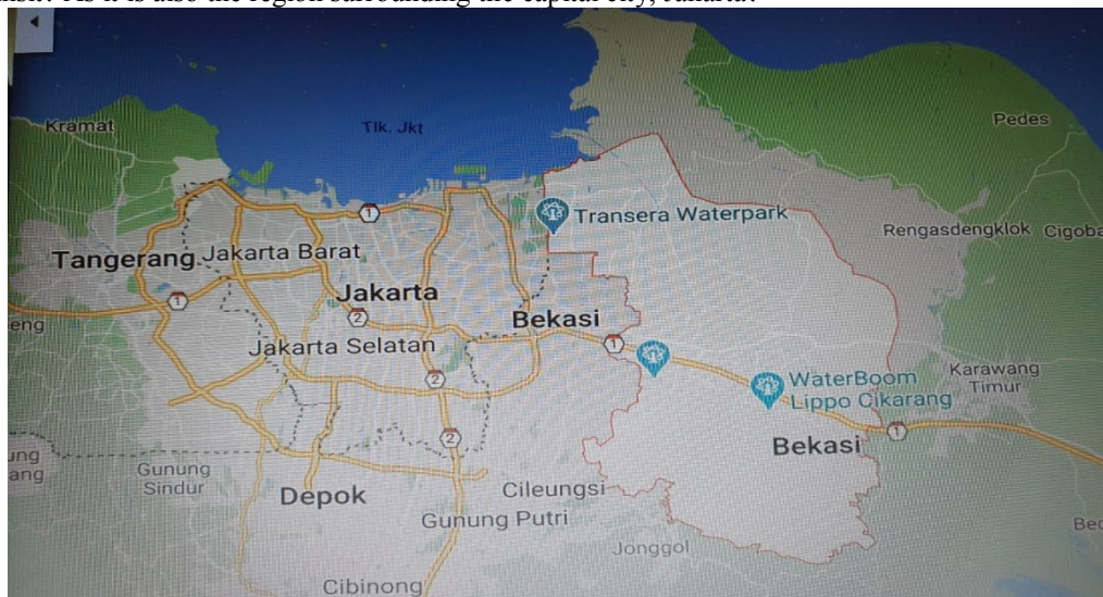
Figure 1:- Map of Bekasi Regency.

Another social issue that attract the communal attention is the many suspect of terrorism captured by the law enforcers during the last 4 (four) years period in Bekasi Regency area. Along the last 4 (four) years, there were 8 (eight) cases of terrorism group member arrest, it is suspected that there were 25 members of in that terrorist group. Those phenomena show that Bekasi regency region has become the transit of those suspect of terrorism. The factors that cause the situation above to happen that because the region is know to be strategic with a dense and very heterogeneous population, also majority of them work as labor. (Bachtiar,2019). The capture of terrorist suspects that has been repeatedly happen causes us to question "why do thoseterrorist chose Bekasi as the place to stay before taking any action?", or another question like, "why don't they choose Tangerang city, Depok city, or Bogor city as the region to transit? As it is also the region surrounding the capital city, Jakarta?"