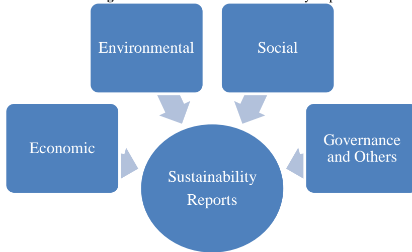
Figure 2:- Dimensions of Sustainability Reports.