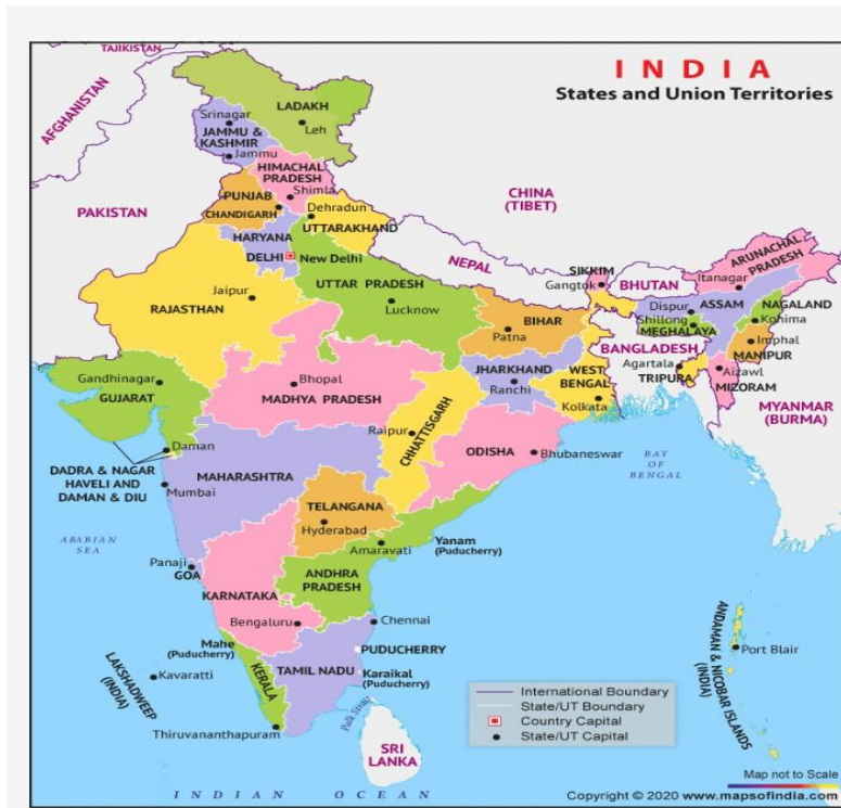
Figure 1:- (A). Map Of India Showing Bihar Location. (B).Map Of Bihar Showing Darbhanga Location.