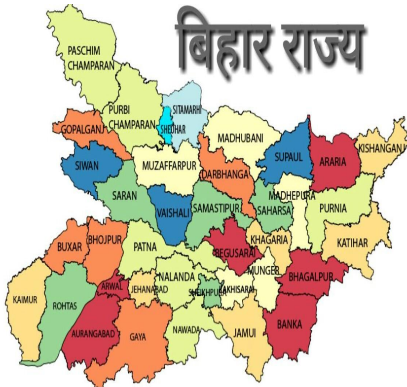
Figure 1:- (C). Location And Geology Map Of The Study Area Showing Sample Locations.