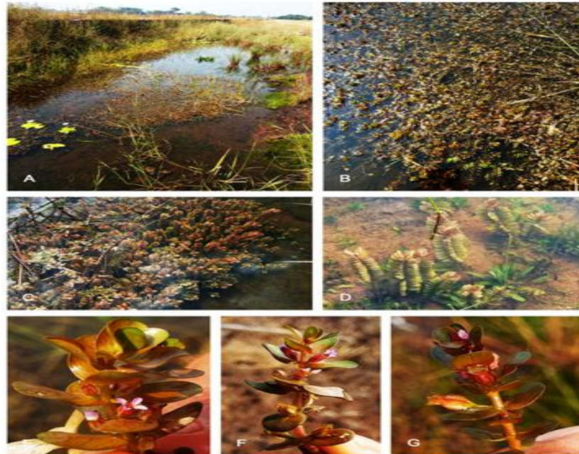
Fig 2:- Rotala baileyana. A. Habitat, B. Mature plants with flowering, C. & D. Young plants, E., F. & G. Flowering twigs.