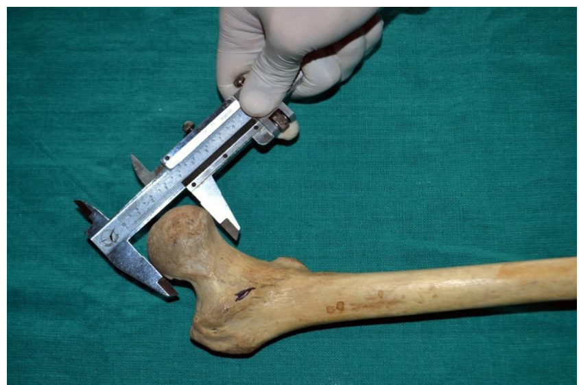
Fig No. 2:- Showing the measurement of Femoral Head Diameter of with the help of vernier caliper.