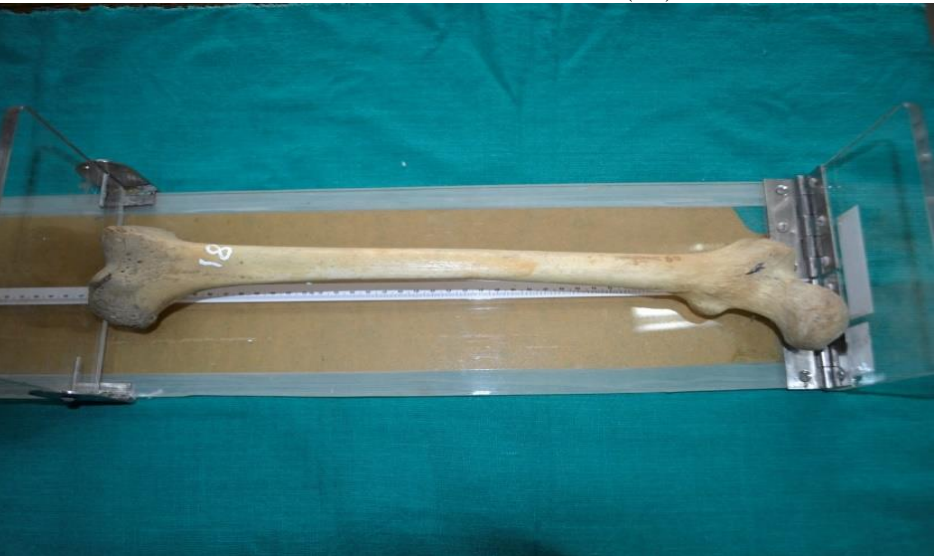
Fig No. 1:- Showing the measurement of Femoral Length on osteometeric board.

It is the distance from highest point of femur head to the lowest point of medial condyle. It will be measured by placing the femur on to the osteometric board and recorded in centimeter (cm).