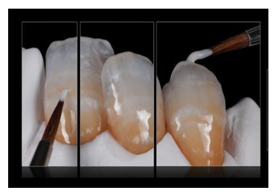
Fig1:- Application of MiYO liquid ceramic<sup>3</sup>

Recently an innovative self-glazing liquid ceramic (MiYO, Jensen Dental) was developed as an alternative to layered ceramics to improve the esthetics of monolithic CAD/CAM or pressed-ceramic restorations.<sup>3</sup> Based on glazing material, this liquid ceramic allows tooth shade and shape modifications, accentuated character, and customization while simultaneously enhancing the surface texture of the monolithic restoration. The liquid ceramic creates an ultrathin ceramic layer that eliminates the need for framework cut back. This is an important factor, since the strength of the ceramics will not be modified through cut back techniques.<sup>3,4</sup> All staining and customization can be done down to 0.1 to 0.2 mm on the ceramic surface. Different color schemes with translucent, semi-translucent, and opaque self-glazing colors were created to improve the color, shade, and shape of zirconia-based and lithium disilicate ceramics.