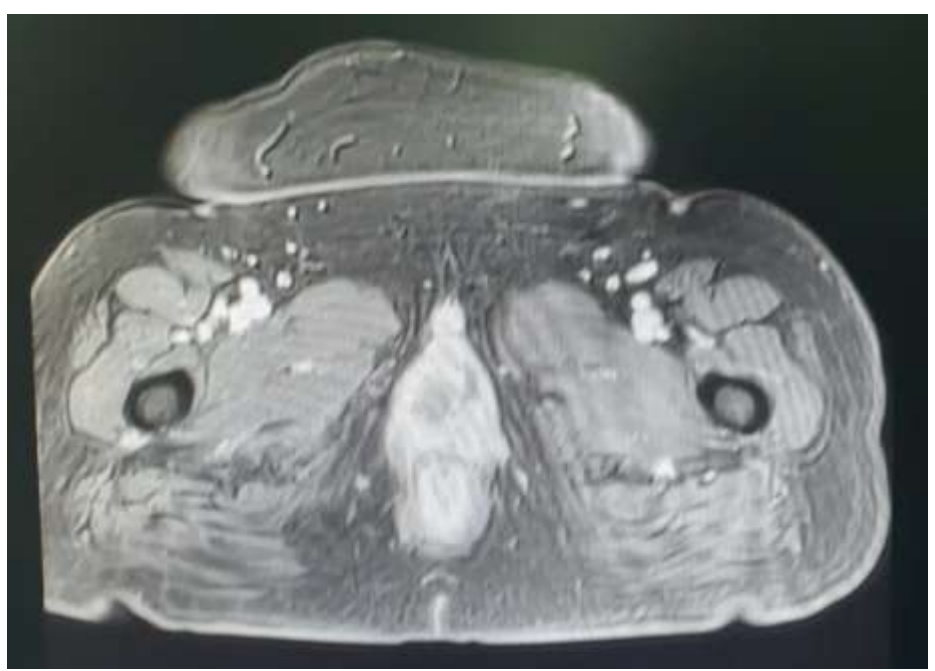
Figure 1:- Pelvic T1-weighted MRI in axial plan after Gadolinium injection showing 45x40x30mmtumor of the anterior vaginal wall. (Before radiotherapy).

Radiation therapy is recommended as a consideration for adjunctive therapy after surgery and for advanced or recurrent disease that is not amenable to surgical resection