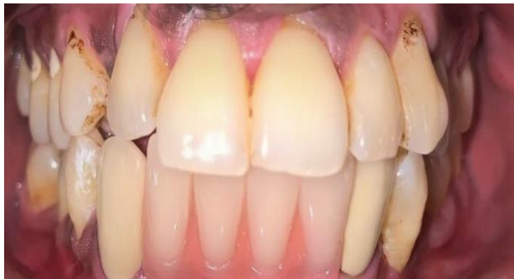
Figure 20: - Teeth setting trial.