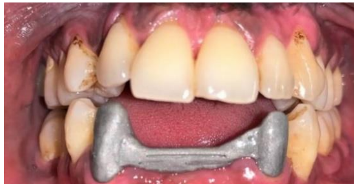
Figure 18: - Metal Try in of Andrews bridge framework after tooth preparation.