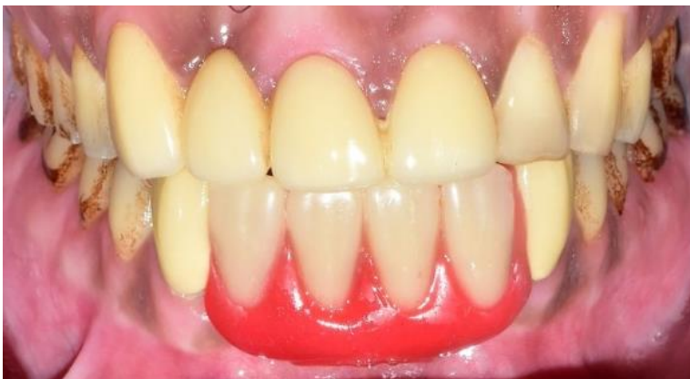
Figure 7: - Removable component of Andrew's bridge -wax trial.