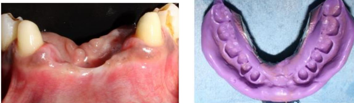
Figure 13: - Tooth preparation of 33 and 43 and Putty light body impression.