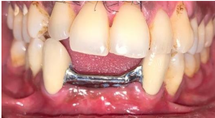
Figure 19: - Try in of fixed component.