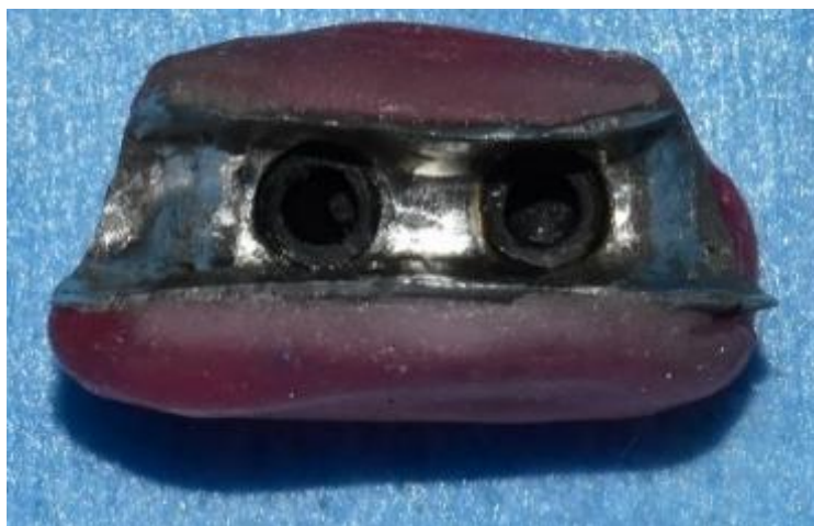
Figure 8: - OT Cap in the intaglio surface of removable component of Andrew's bridge.