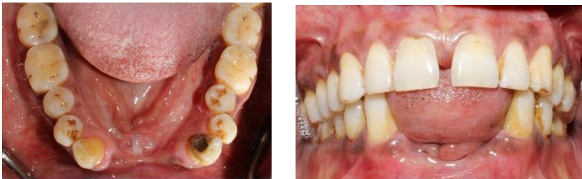
Figure 12: Intraoral pre-operative view