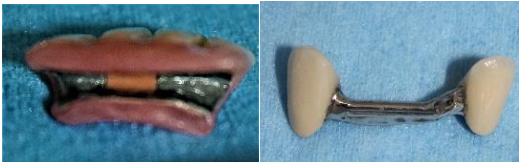
Figure 21: - Ribbed bar and intaglio surface of removable component with metal sleeve and nylon clip.