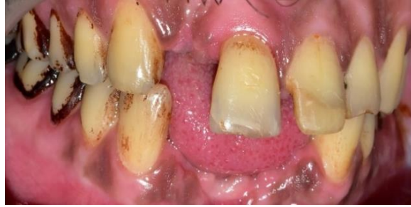
Figure 2: - Pre-operative intraoral view.