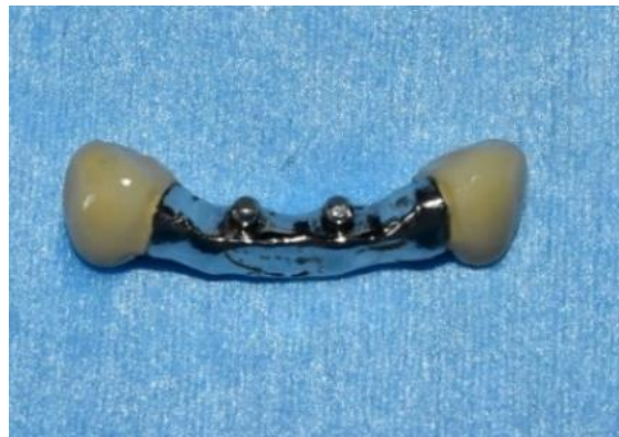
Figure 5: - Fixed component of Andrews bridge Intraorview.