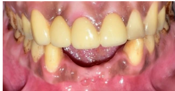
Figure 4: - Zirconia FPD in relation to 11,13,21.