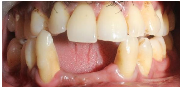
Figure 17: - Pre operative intra oral view