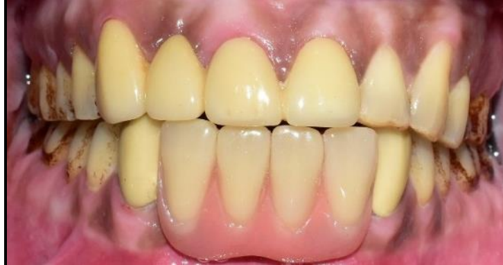
Figure 9: - Post-operative intraoral view.