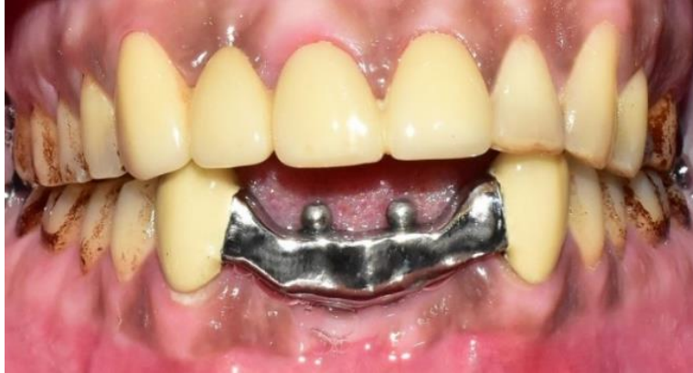
Figure 6: - Fixed component of Andrews bridge -Intra oral view.