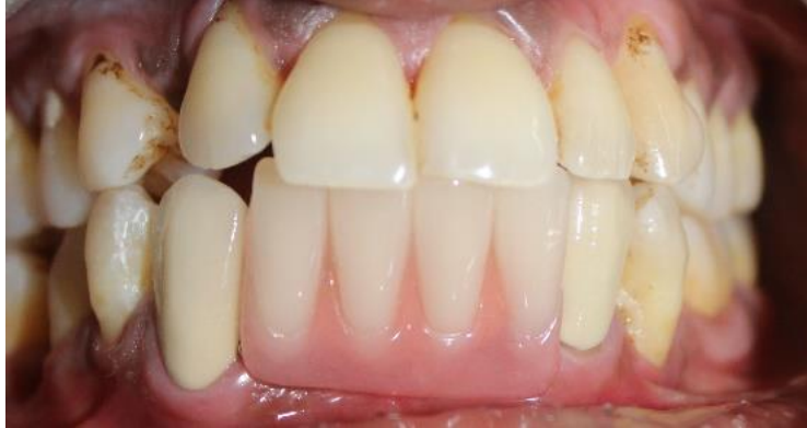
Figure 22: - Post-operative intraoral view.