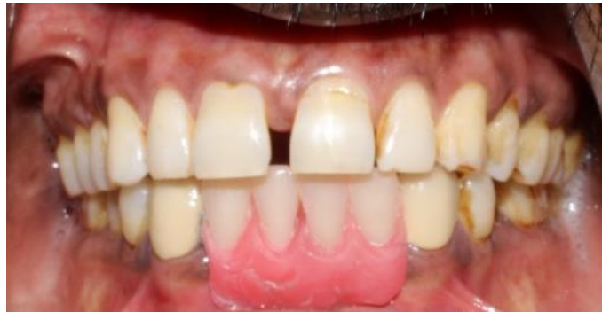
Figure 15:- Wax tryin of the removable component