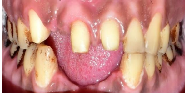
Figure 3: - Tooth preparation on 11,13,21.