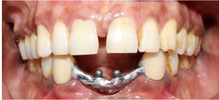
Figure 14: - Metal framework trial