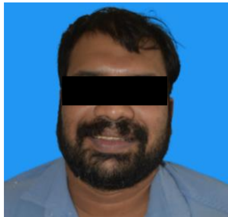
Figure 10: - Post operative extra oral view.