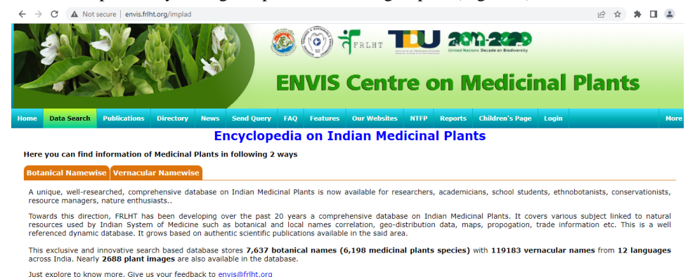
Figure 5:- Screenshot of GUI of the ENVIS Centre on Medicinal Plants database hosted by FRLHT, Bengaluru, India.

Ministry of Environment and Forests, Government of India has established an environmental information system (ENVIS) with the help of World Bank. ENVIS is also the Asia's sub-regional nodal centre of INFOTERRA (the global network of United Nations Environment Programme), which serves the purpose of providing access to highly equipped libraries and network systems to the needy people. This data source is hosted by Foundation for Revitalisation of Local Health Traditions (FRLHT), Bengaluru, India. It provides unique platform and one stop access point for collection, curation and dissemination of authentic multi-dimensional information about Indian Medicinal Plants through media. This centre's success relies on the large number of visitors (8331670 lakhs hits and 699404 visitors' per annum). This database is well referenced dynamic database based on peer reviewed scientific publications. It contains information regarding 6198 medicinal plants species with their 7637 botanical names and 119183 vernacular names in 12 languages. It also has approximately 2688 images of medicinally important plants. The database is accessed publically through http://envis.frlht.org/implad (Figure-5).