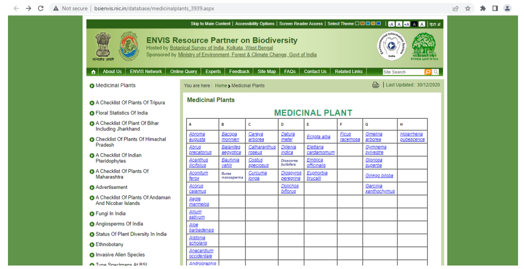
Figure 6:- Screenshot of GUI of the ENVIS Resource Partner on Biodiversity hosted by Botanical Survey of India, Kolkata, India.

Another ENVIS centre on "Plant Ecology", hosted by Botanical Survey of India, Kolkata, India is collecting, managing and disseminating information about "Floral Diversity" across the various states of India. The database has all published bibliography on flora, list of endemic and threatened taxa from different states of India. The database displays comprehensive information about the medicinal plant such as their synonymous names. English name, Vernacular names and Trade name along with traditional and modern use, phytography, distribution, ecology and cultivation, and chemical contents. The database is accessed publically through http://www.bsienvis.nic.in/database/medicinalplants_3939.aspx (Figure-6).