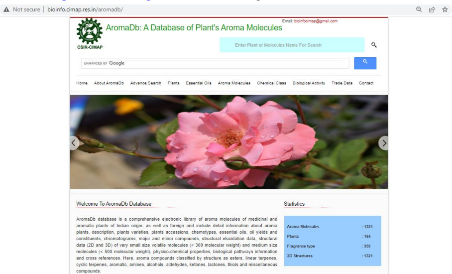
Figure 2:- Screenshot of GUI of the AromaDB database hosted by CSIR-CIMAP, Lucknow, India.

AromaDb is a database of aromatic molecules of medicinal and aromatic indigenous plants (Kumar et al. 2018). It contains detail data about aroma plants. The database describes plants varieties, accessions, chemotypes, essential oils, oil yields and constituents. It also contains chromatograms of aromatic molecules, their compounds, elucidated structural 2D and 3D data. AromaDB has 1321 chemical structures of aromatic molecules, and classified the aroma types, 357 as fragrance like, whereas 166 plants are used commercially along with their high yielding 148 chemotypes(Kumar et al. 2018). It also comprises the use of aromatherapy for the treatment of diseases related to cell signalling pathways through interacting human genes. Additionally, it has reported volatile molecules of various sizes, their physico-chemical properties, and information about their biological pathways with cross references. The aromatic compounds are categorized by structure as esters, linear terpenes, cyclic terpenes, aromatic, amines, alcohols, aldehydes, ketones, lactones, thiols and miscellaneous compounds. The AromaDb is freely available on public domain online at: <a href="http://bioinfo.cimap.res.in/aromadb/">http://bioinfo.cimap.res.in/aromadb/</a> (Figure-2).