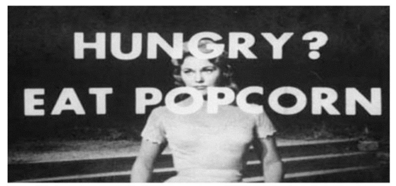
Kaynak: (https://tr.pinterest.com) Figure 2:- The adrirtising of Popcorn. Reference: (Çetin, 2013).

A device called a tachistoscope is based on rapid image or image-based text display. Subliminal sounds also exist. Subliminal messages are conveyed through specific speech, music, or songs that we listen to but cannot hear with our ears, yet our subconscious mind can perceive them. The first audio subliminal message was broadcast on the famous international radio BBC.