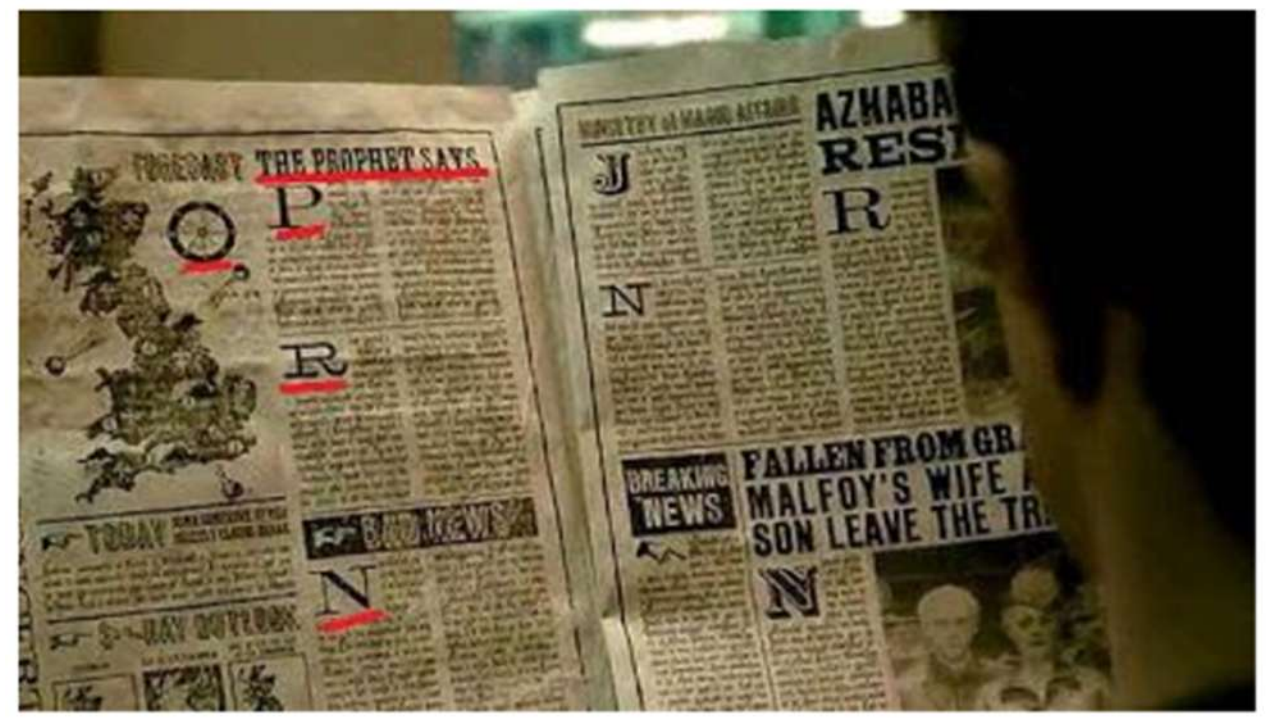
Figure 3:- The Harry Potter movie that capital letters spell out the word "PORN". Reference: (Gör, 2019).

The following example is a scene from the Harry Potter movie. In the image, capital letters spell out the word "PORN" prominently.