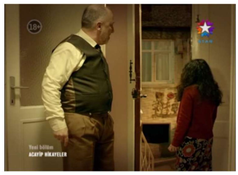
Figure 6:- A short picture of a Collection of Amazing Stories serial. Reference: (Gör, 2019).