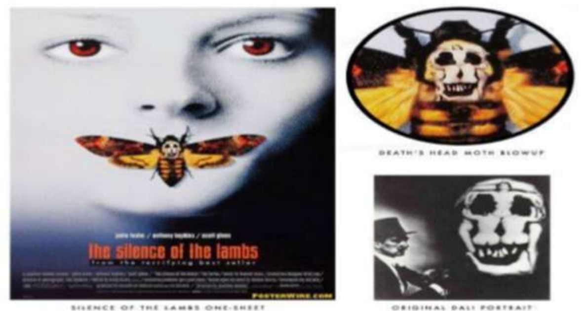
Figure 5:- The Silence of The Lambs.Reference: (Çetin, 2013).

"The Silence of the Lambs" is one of the most intriguing examples of film posters. Ancient symbols of death and rebirth (and related sexual inclinations) are visually presented on the movie poster. Pay attention to a skeletal figure in the shape of a butterfly on the poster and 7 images of naked women inside this skeletal figure.