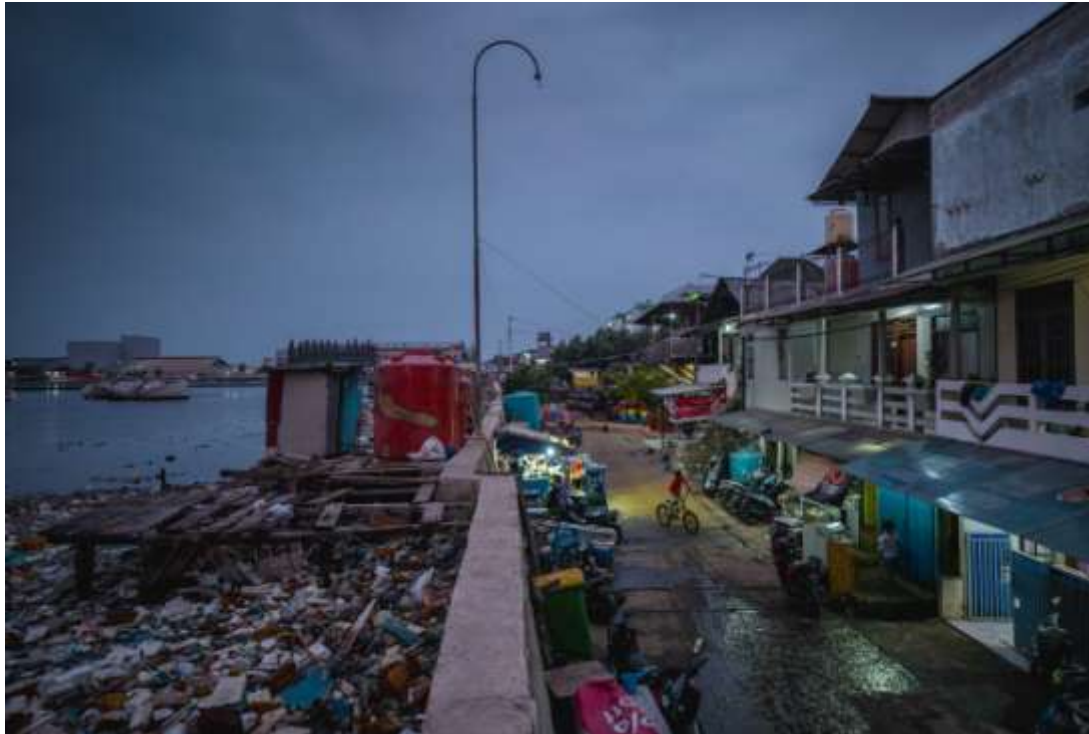
Figure 3:- Plastic waste piled up along the sea wall in the GedongPompa neighborhood of Jakarta.

new legislation on trash management and marine debris management. However, ineffective regulation has posed a barrier, and plastic bags are still frequently used in traditional marketplaces.