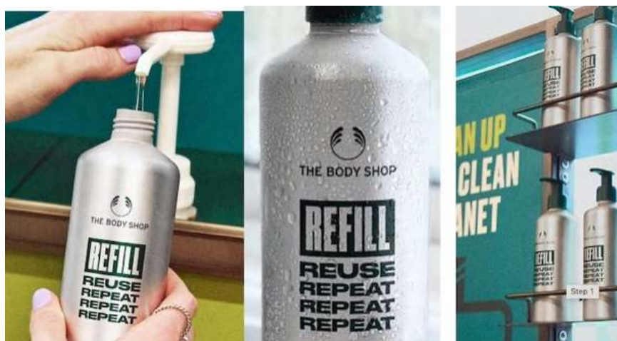
Figure 5:- The Body Shop refill station.

The Body Shop do empower for society to embrace the circular economy and help eliminate waste by making refill stations across 720 of The Body Shop stores globally and they are launching a further 130 in 2023 (The Body Shop, 2023). By making closet zero waste packaging choice as easy, convenient, and accessible as possible, it can make a big difference. Switch to refill and collectively, The Body Shop could save over 1 million plastics by the end of 2023. Indonesia is one of the countries that has presented the body shop refill station. The Body Shop has been in Indonesia since 1992 (The Body Shop® Indonesia, 2023). Refill station owned by The Body Shop is present in Indonesia not only to inspire more people not to immediately throw away a package, but also to reuse it. Using The Body Shop's aluminum refill bottle pack can save more than 25 tons of plastic every year. These small steps will make Indonesia reduce excessive consumption of single-use plastic and make the earth better.