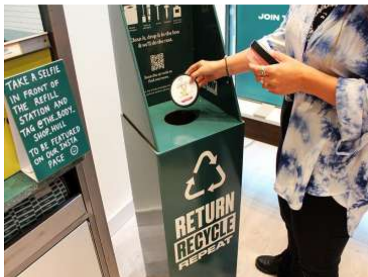
Figure 4:- Image of Return, Recycle, Repeat recycling box © ReWorked.

lives of thousands of people in communities all over the world, and it has received numerous awards for its beneficial impact.