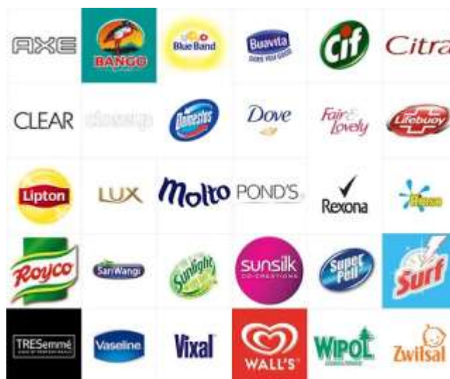
Figure 2:- Unilever's Products in Indonesia.

Unilever Indonesia is one of Indonesia's leading consumer products producers. Unilever Indonesia, established on December 5, 1933, has grown to become one of Indonesia's leading Fast Moving Consumer Goods (FMCG) companies, with products such as Pepsodent, Lux, Lifebuoy, Dove, Sunsilk, Clear, Rexona, Vaseline, Rinso, Molto, Sunlight, Wall's, Royco, Bango, and others (Unilever, 2023). Unilever Indonesia's product portfolio includes soaps, detergents, and cosmetics, as well as foods and refreshment items such as margarine, dairy goods, ice cream, tea, and fruit juice. The company has more than 40 brands and nine factories located in the industrial areas of Jababeka, Cikarang, and Rungkut, Surabaya. Unilever Indonesia markets its products through a network of over 800 independent distributors who serve hundreds of thousands of retailers throughout Indonesia (Unilever, 2023). Each Indonesian home is predicted to use the company's products. Unilever Indonesia's shares were originally made available to the public in 1981, and the company has been listed on the Indonesia Stock Exchange since January 11, 1982.