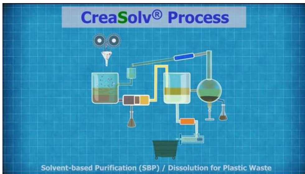
Figure 4:- CreaSolv process animation.

Unilever created CreaSolv, a recycling technique that attempts to recycle high-value polymers from worn and dirty multi-layer sachets so that they can be reused to make safe, non-food packaging (Unilever, 2018). The CreaSolv method includes dissolving the sachets in a solvent to split them into their component layers. The high value