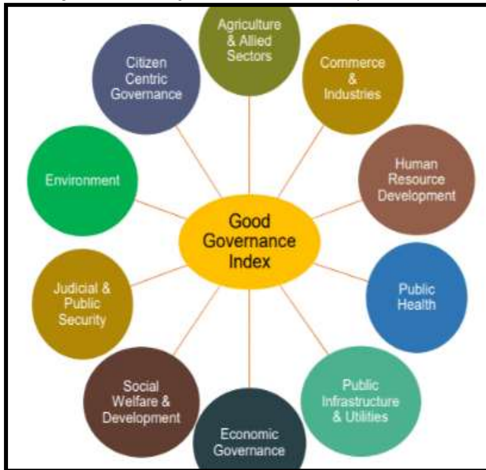
Figure 2:- Good governance index.

In order to serve efficiency to the general population of a country, the government of country leaders needs to activate the policies for the public. Public administration consists of some of the major principles that are able to improve the relationship of citizens with the government and maintain harmony.