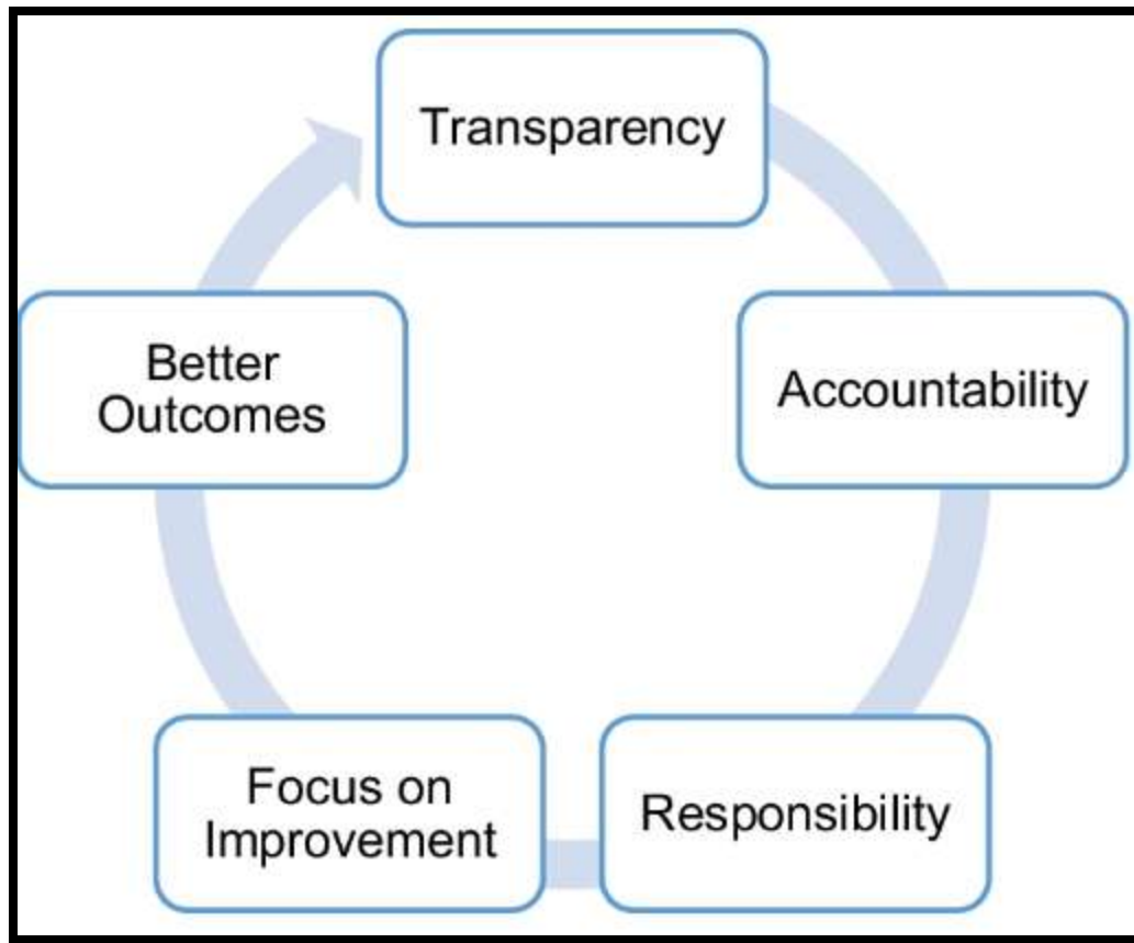
Figure 3:- Characteristics of Public Administration.

Decision-making processes are important in public policy reformation where technology helps in an effective manner. In this context, Cheng (2019) mentioned, it also helps in accommodating technology in the country and gave access to people. Taking care of the health of citizens is also the concern of the government where policies and funding of officials help in managing the hospital and medical centers. The collection of taxes has the ability to solve serious problems like unemployment, poverty, and many more. Here, Hill & Varone (2021), the loopholes in government policies help fraudsters to mislead the official, which helps them manage the amount for their own benefit. Loss in tax collection affects a country poorly for which making policies strictly are important.