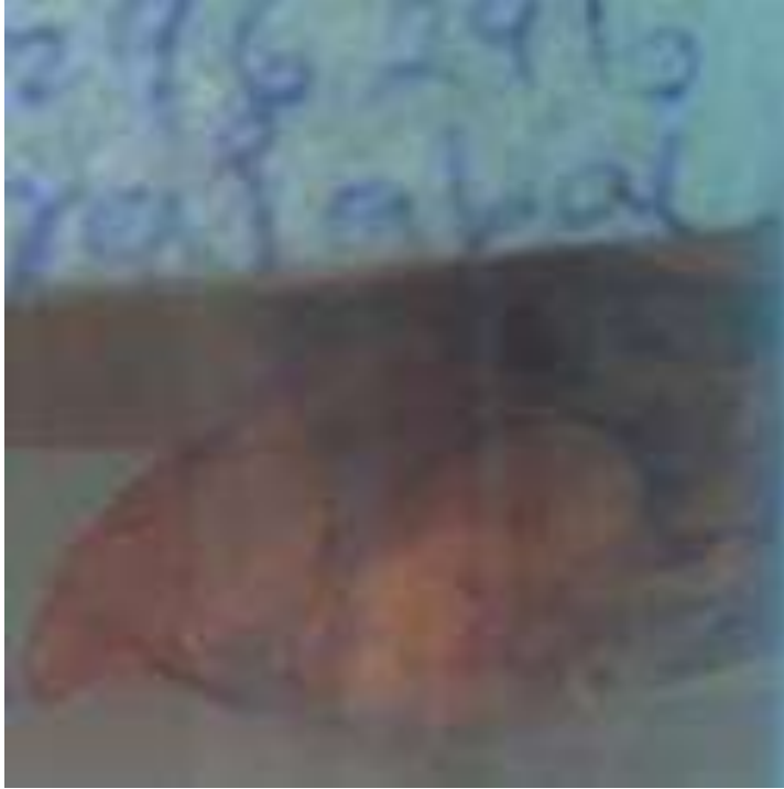
Figure 5:- Cut section of the well defined tumor with fibrofatty tissue.