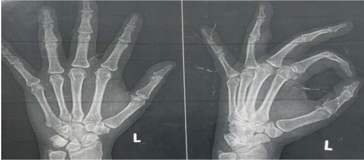
Figure 2:- Soft tissue swelling on palmar aspect of finger without any bony changes.