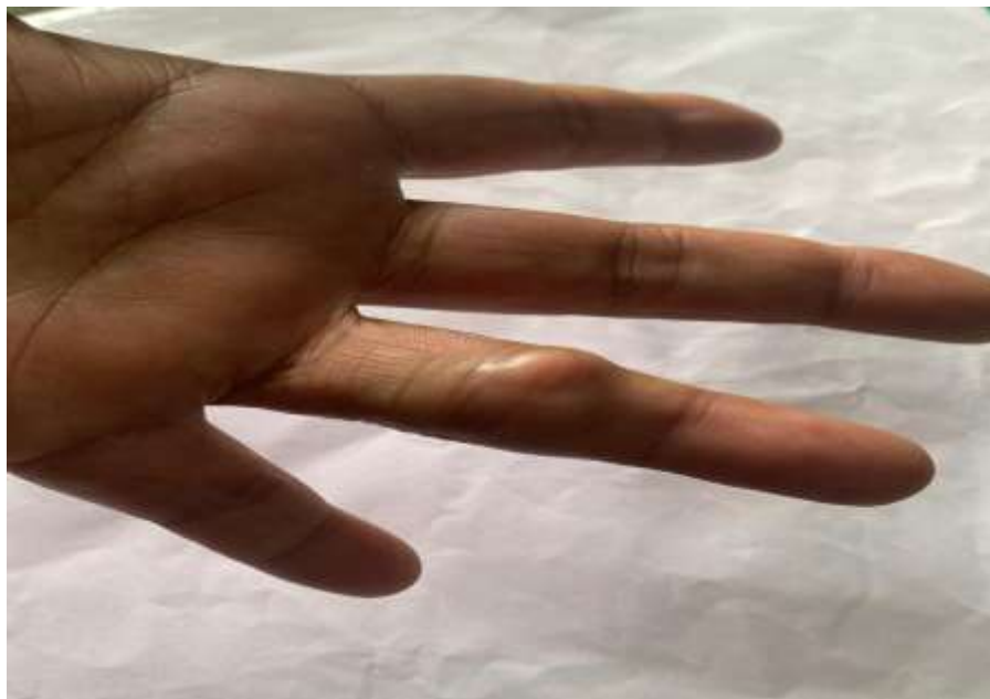
Figure 1:- Swelling on palmar aspect of index finger.

Examination revealed a 2 cm * 1.5 cm firm swelling situated on the palmar aspect of the right ring finger over proximal inter phalangeal joint (Fig. 1). There was no local rise of temperature or involvement of the skin. Swelling was well defined, its surface was smooth and consistency uniformly firm. The swelling could be moved sideways easily, but its mobility from proximal to distal was limited. There was no involvement of bone clinically. The swelling moved on movement of finger.