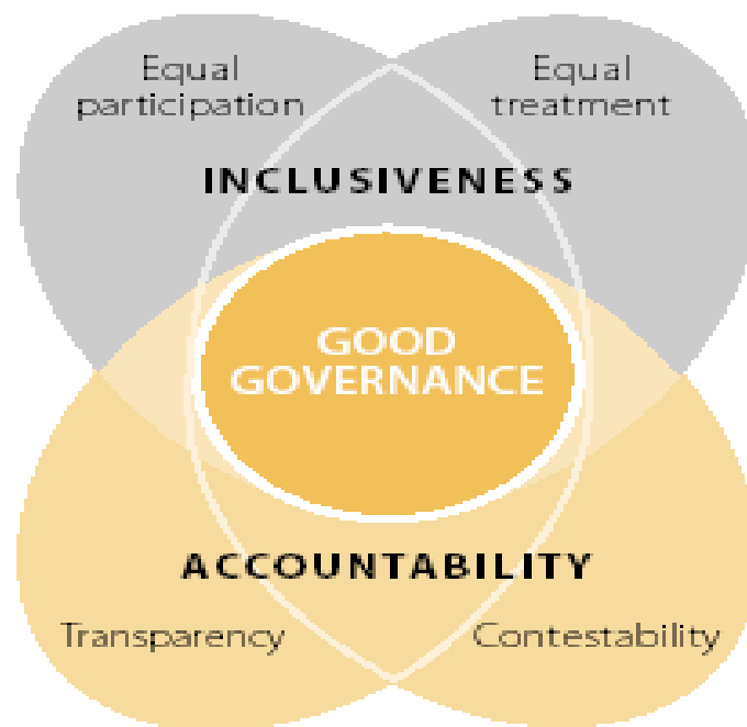
Figure 1.2:- World Bank Governance Model.