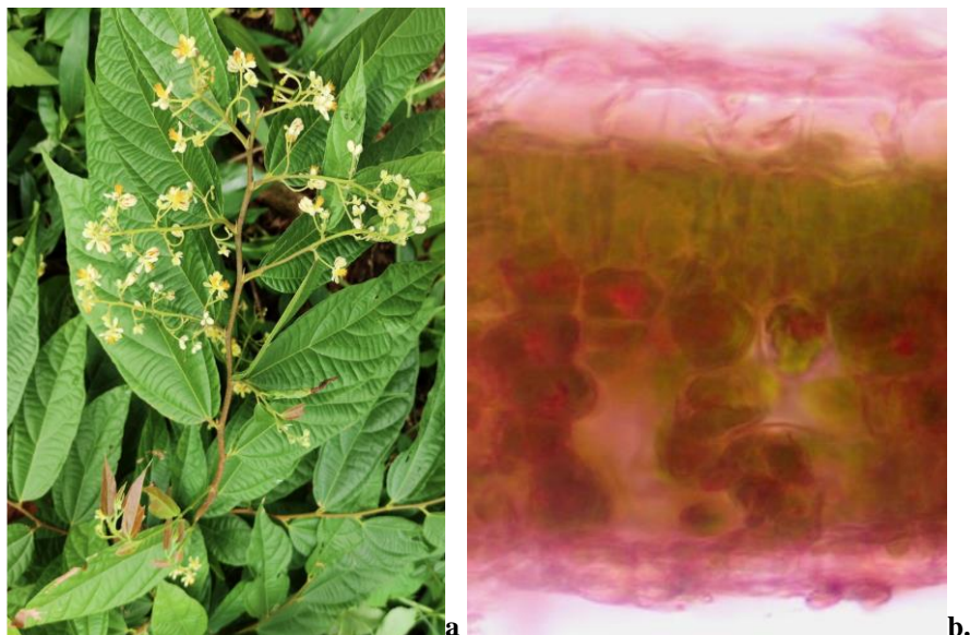
Plate-1. Habit and Anatomical Characteristics of Micrococcus paniculata L. a. Habit; b. Lamina; & c. Stomata.

The radial longitudinal section (R.L.S.) showed wider vessels with simple perforations. The lateral walls of vessels showed bordered pits. Xylem parenchyma and tracheids were present. The tracheids are smaller and with narrow lumen (Plate-1). The tangential longitudinal section showed parenchymatous ray cells. The fibres and parenchyma are shorter in size. The ray cells showed the deposition of prismatic crystals (Plate-3).