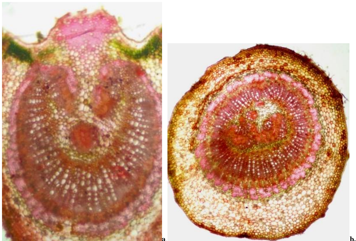
Plate-2. Anatomical Characteristics of Micrococcus paniculata L. a. Midrib; & b. Petiole.