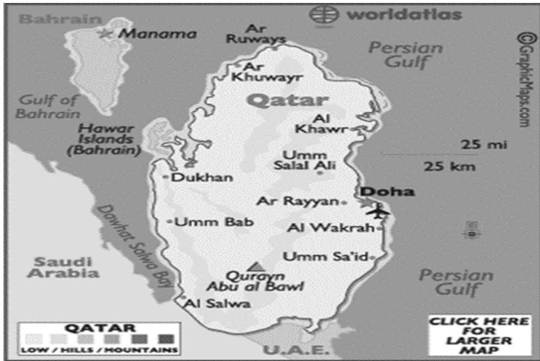
Figure 1:- Map of Qatar.