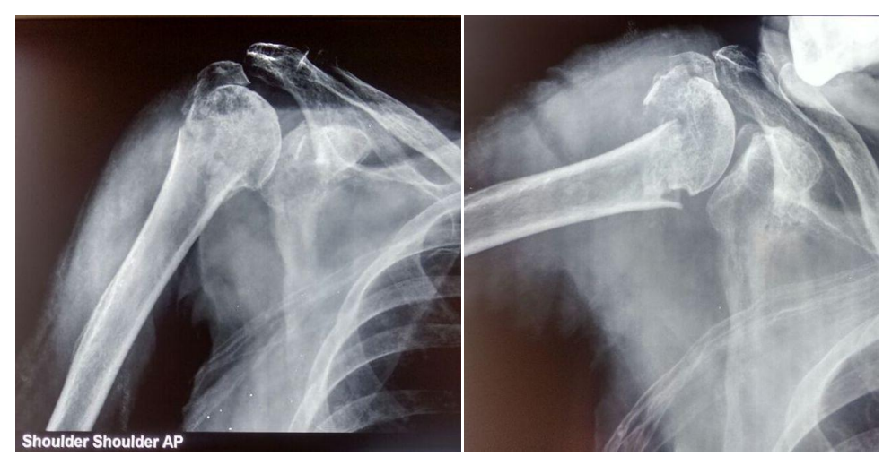
Figure 2a:- Plain radiograph AP View showing greater tuberosity fracture.

A 90-year-old female patient presented to the emergency department with pain, restricted range of movements with swelling of the right shoulder following accidental fall at her residence. Local examination there was a gross swelling over the right shoulder with tenderness at the deltoid region with restricted and painful active and passive range of shoulder movements with no external injuries. Both antero-posterior and axillary lateral radiographs revealed a four part fracture according to Neer's classification, with osteoporotic bones with intact gleno-humeral joint (Figure 2a,b).