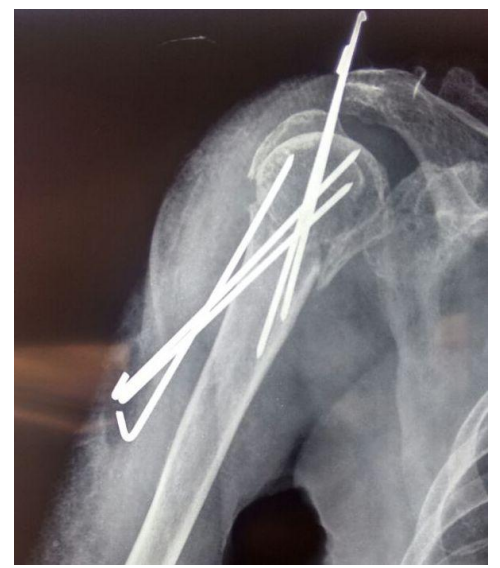
Figure 3:- Post-operative plain radiograph showing fracture reduced and fixed with K-Wires.

and fixed with five K-wires three infero-laterally and two of them supero-laterally giving the fracture a rigid fixation (Figure 3).