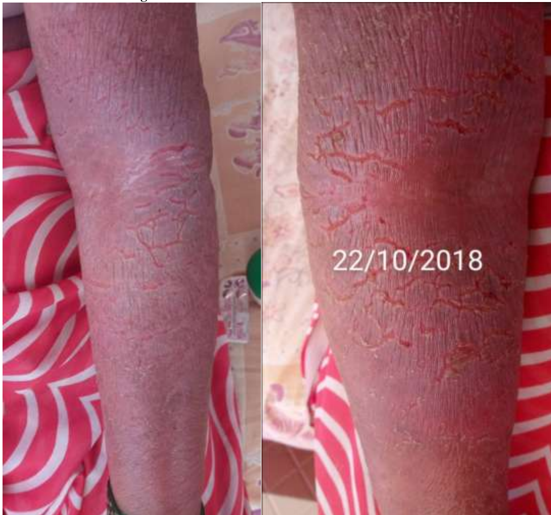
Figure No. 02 and 03:- Before Treatment 22/10/2018.