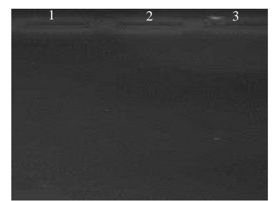
Figure 3:- Gel electrophoresis image illustrates extracted E.coli genetic profile migration after 5, 10 and 15 minutes of irradiation with 805nm diode laser.