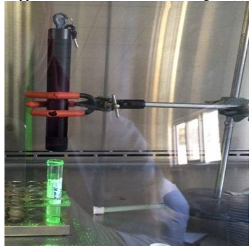
Figure 1:- laser sensitivity test shows the setup of irradiation method by Diode laser (805nm).

The 805nm Diode laser was used in this study with spot size diameter of 5mm. The exposure time was adjusted for 5,10 and 15 minutes. The setup of chopped diode laser is illustrated in Figure (1).