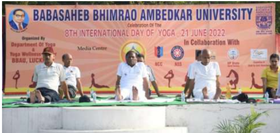
Fig 4:- Use of Emblem in Banner design for celebrating 8 th International Day of Yoga at BBAU.

From a technical perspective, the emblem is meticulously crafted in line art, ensuring a clean, precise, and scalable design that maintains clarity across various applications, from digital platforms to (Fig. 4) physical prints. However, there have been some suggestions for redesigning the emblem to align with contemporary design trends, which emphasise minimalism, simplification, and modern aesthetics while retaining the core symbolism and identity of the university. The present emblem follows a traditional approach, incorporating a multiplication of the same symbols across the design to create a balanced and harmonious composition.