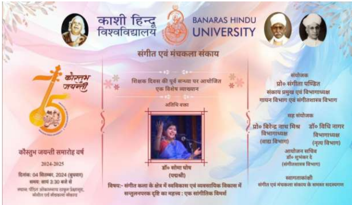
Fig 6:- The logo is applied to the banner design for the Faculty of Performing Arts cultural event of BHU.

The logo is meticulously crafted as a bilingual logotype, integrating Devanagari and Roman scripts to ensure global accessibility and recognition. A key feature of the logo is incorporating the official BHU emblem, maintaining the university's traditional essence.