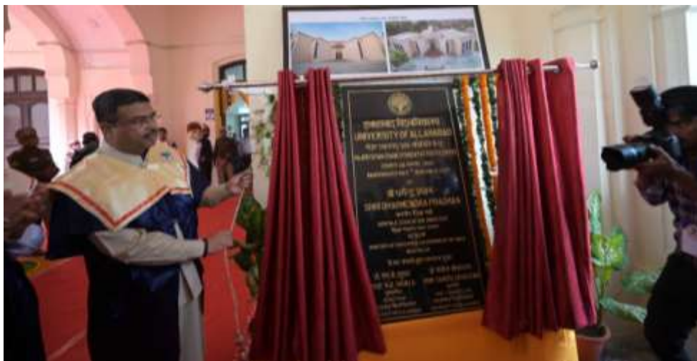
Fig 8:- Application of the emblem at the top of the inaugural stone panel.

The University of Allahabad's visual identity has been meticulously crafted, ensuring its design elements align with contemporary design trends while maintaining a strong connection to its rich heritage. The emblem has been developed with a modern illustrative line-based approach, creating a refined and elegant aesthetic that enhances clarity, adaptability, and versatility across various applications.