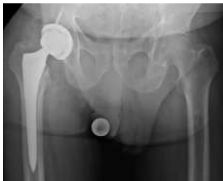
Pre Operative MRI