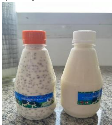
Figure 1:- Photograph of a sample of bottles of milk and “deguê”.

This study was conducted using bottles of milk and “deguê” (Figure 1), purchased from bakeries in Abobo (Abidjan, Côte d'Ivoire). These products, obtained from five bakeries located in this locality, were placed in a cooler before being transported to the microbiology laboratory at Nangui ABROGOUA University for subsequent analyses.