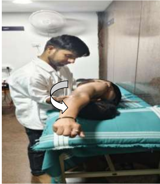
Fig-4:- Step 2(Shoulder flexion).