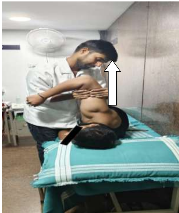
Fig-6:- Step 4(Circumduction with traction)