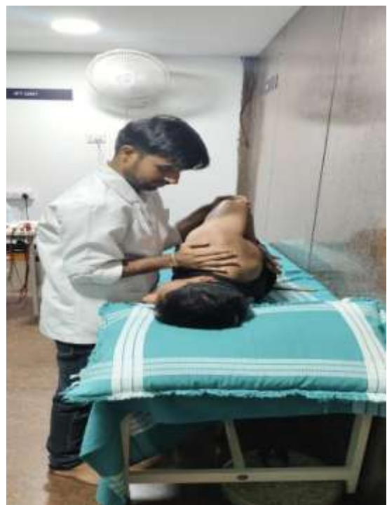
Fig-7:- Step 5(Shoulder abduction and IR).