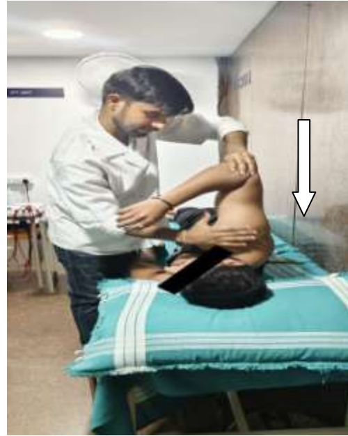
Fig-5:- Step 3(Circumduction with compression).