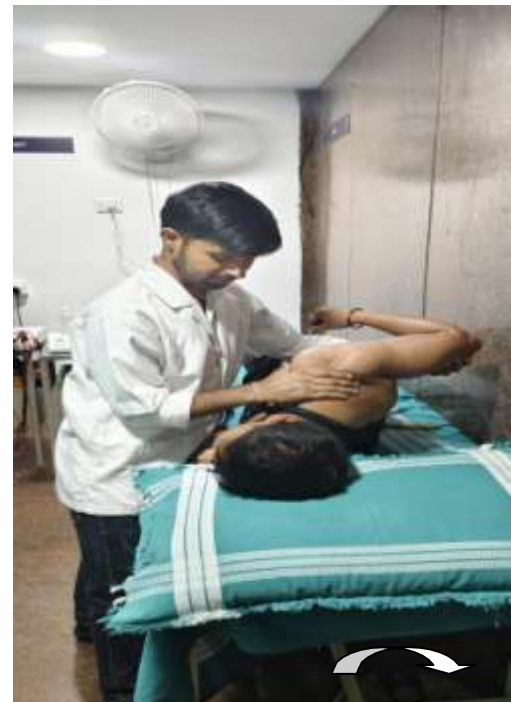
Fig-3:- Step 1 (Shoulder extension).