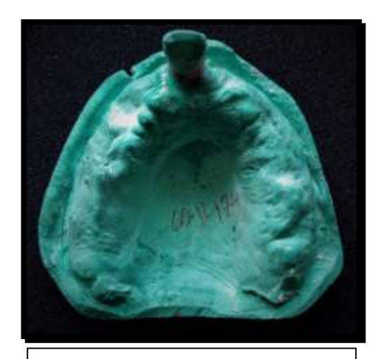
Fig. 3:- Maxillary master cat.

In the first appointment, diagnostic impression of maxilla and mandible were made using irreversible hydrocolloid (ZhermackTropicalgin alginate impression material). Followed by fabrication of custom tray with full coverage spacer design on the diagnostic cast on maxilla using autopolymerizing acrylic resin was done (DPI RR Cold cure, DPI India). In the second appointment, border molding using green stick compound (DPI pinnacle tracing sticks, DPI India) and secondary impression was made with light body impression material (HUGE PERFIT Elastomeric Impression Material, Light Body- Type 3). Master cast was prepared (Fig. 3) and occlusal rims fabricated on which bite registration was recorded on the third appointment.