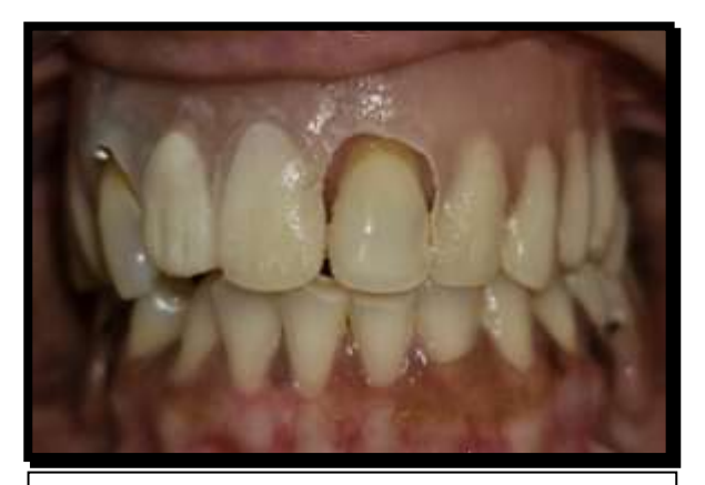
Fig. 9:- Post-operative image with denture in maxillary and mandibular arch with CUSIL denture.

The wax try-in was done in both maxillary and mandibular arch, evaluation of occlusion, dental esthetics, facial esthetics were examined and proceed with acrylization. The denture was finished, polished and insertion was done in maxillary and mandibular arch. (Fig. 9) Denture was fabricated with opening to allow the remaining natural teeth to pass through and protrude while providing a seal around them. The patient was recalled on a periodic review (1 week, 3 weeks, 1 month, 3<sup>rd</sup> month& 6<sup>th</sup> month) which showed that the patient was comfortable in using the denture.