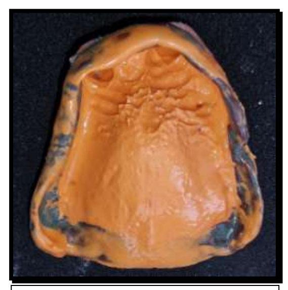
Fig. 8:- Secondary impression of maxillary