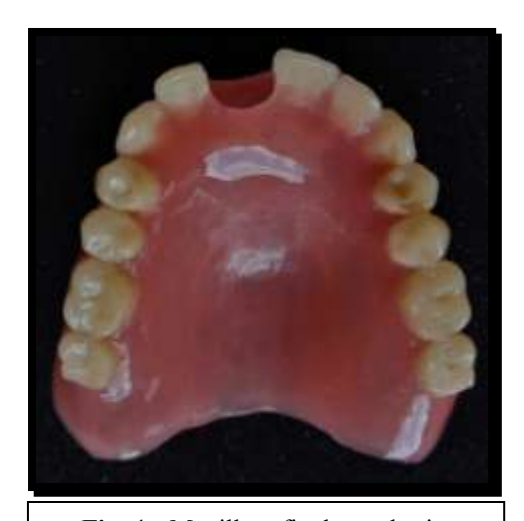
Fig. 4:- Maxillary final prosthesis.