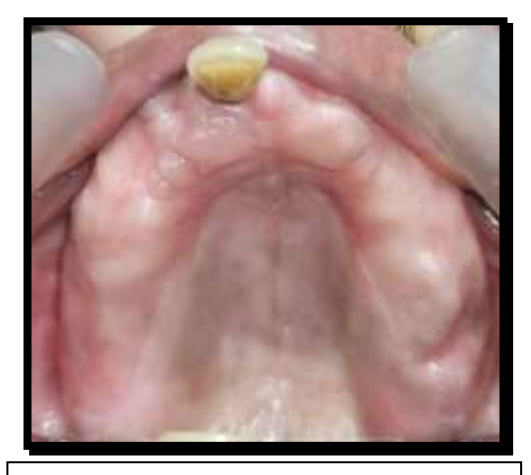
Fig. 1: -Pre-operative maxillary arch

mandibular teeth were supra-erupted with a full metal crown in relation to 45 and amalgam restoration in 47. A brief dental history stated that the missing teeth were extracted due to caries. It was planned to fabricate a transitional denture(CU-SIL denture) for maxillary arch and a removable partial denture in mandibular arch as the patient was not willing for extraction of his remaining teeth.