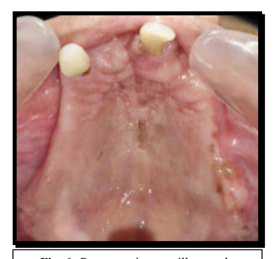
Fig. 6:-Pre-operative maxillary arch.

A 50-year old female patient reported to our department with chief complaint of difficulty in chewing and also complaints of poor esthetic appearance and wanted replacement of her missing teeth. On intra-oral examination the patient had Kennedy's class I modification 1 edentulous space in maxilla with presence of only 13, 21 (Fig. 6) and Kennedy's class I edentulous space in mandibular arch (Fig. 7). On examination of individual teeth 13 & 21 had gingival recession. It was planned to fabricate a transitional denture(CU-SIL denture) for maxillary arch and a removable partial denture in mandibular arch as the patient was not willing for extraction of her remaining teeth.