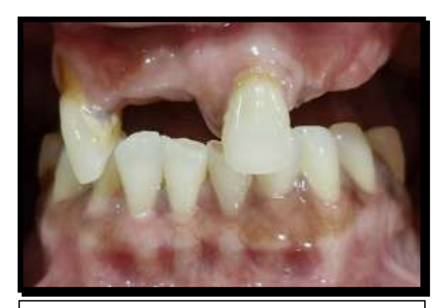
Fig. 7:- Pre-operative front view of maxilla & mandible at occlusion.