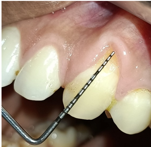
Figure 1:- Pre Operative View

On intra oral examination it was seen as Miller's class I gingival recession of 3 mm on tooth #23. Clinical attachment loss (CAL) was 4 mm. Probing pocket depth (PPD) was found to be 1 mm. The gingival biotype was thin, with keratinized tissue width of 2 mm.