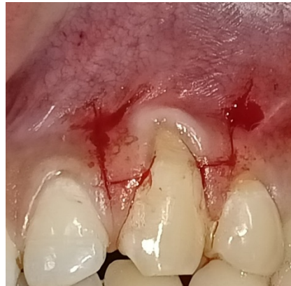
Figure 3 :- Primary incision.

The surgical method for addressing gingival recession involved a trapezoidal-type flap (Figure 3), which completely enveloped a connective tissue graft (CTG) derived from the de-epithelialization of a free gingival graft (FGG) (Figure 4)