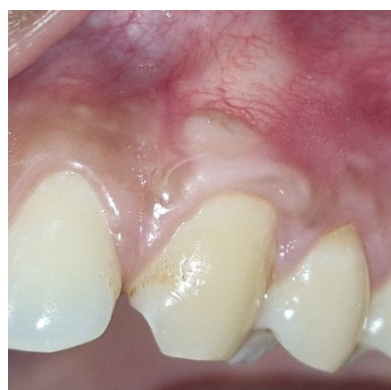
Figure 9 :- 8 month follow up.