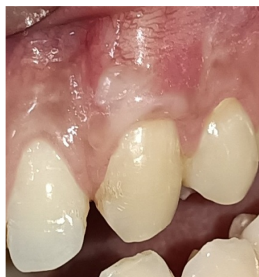
Figure 8 :- 4 month follow up.