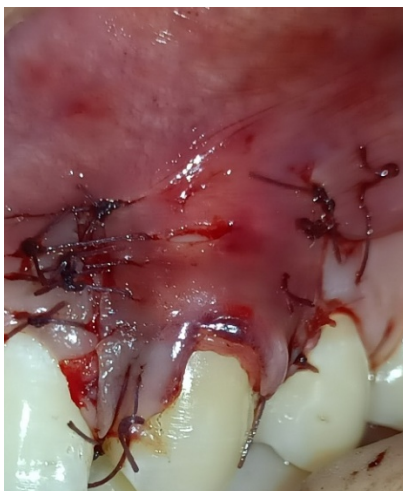
Figure 5 :- Immediate post surgical situation.