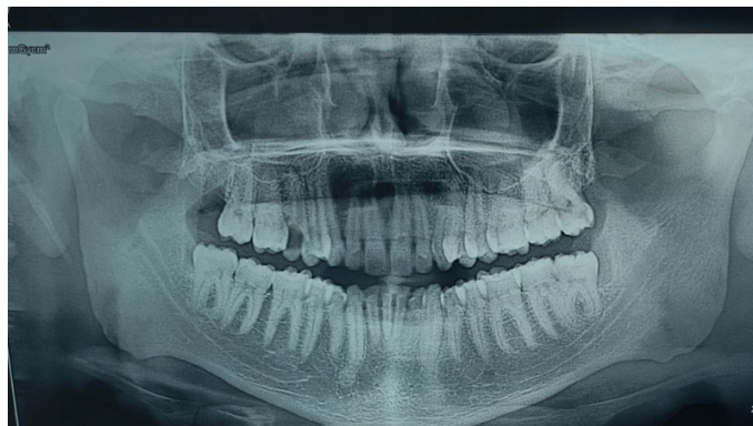
Figure 2(b):- Pre operative OPG.