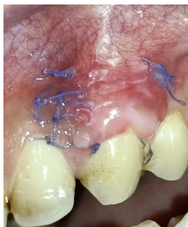
Figure 6 :- 14 days follow up.

Patient was followed up after 14 days (figure 6),1 month (figure 7),4 months (figure 8) and 8 months (figure 9)