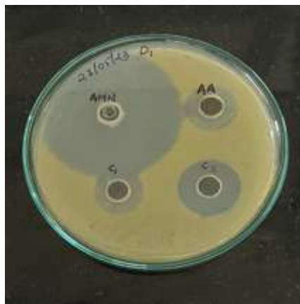
Fig 1:- Analysis of antibacterial activity of chitosan against D1 colony. AMN- Amoxycillin, AA-Acetic acid, C1 250µg/ml and C2-500µg/ml.