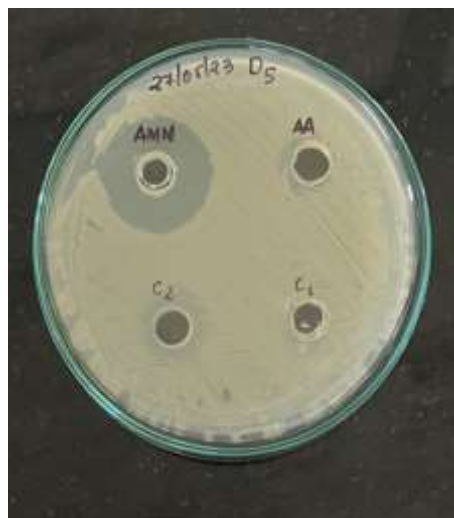
Fig 5:- Analysis of antibacterial activity of chitosan against D5 colony. AMN- Amoxycillin, AA-Acetic acid, C1 250µg/ml and C2-500µg/ml.