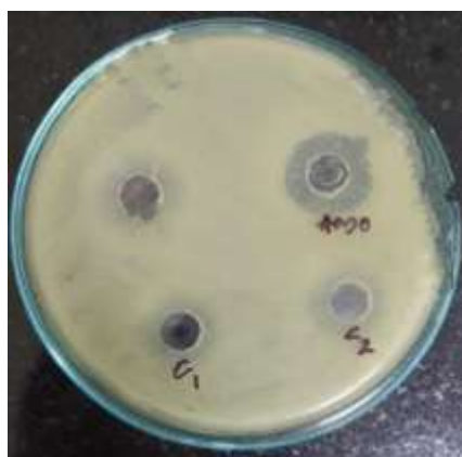
Fig 2:- Analysis of activity of chitosan against D2 colony. AMN- Amoxycillin, AA-Acetic acid, C1 250µg/ml and C2-500µg/ml.