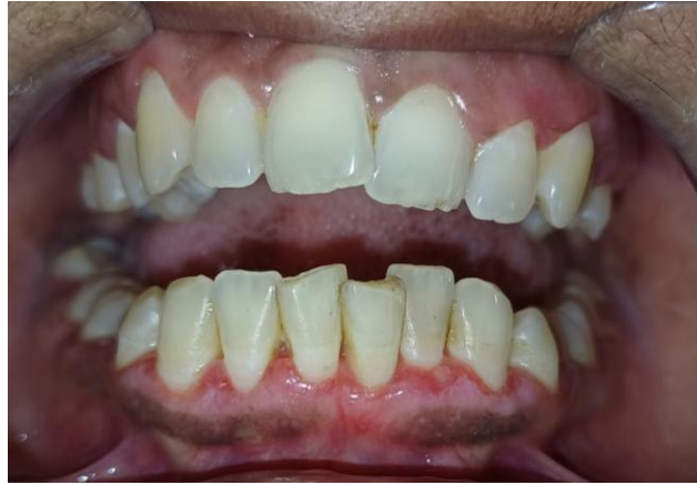
Figure 4:- Follow up after 1 week.