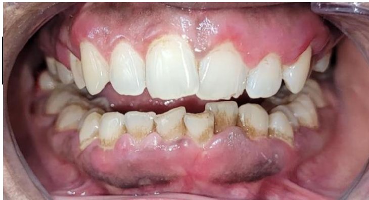
Figure 1:- Intra oral picture depicting enlargement and inflammation in the lower anterior region.

Upon intra oral examination, gingival enlargement noted in the lower anterior labial side with a probing pocket depth of 6mm with attached gingiva width of 9mm.( figure 1) surface of gingiva appeared smooth and erythematous with loss of stippling. Poor oral hygiene status was assessed with presence of local irritating factors surrounding the teeth.