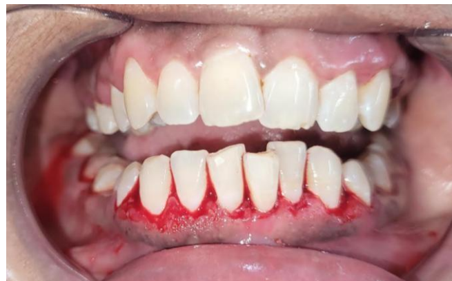
Figure 3:- After removal excess tissue through gingivectomy.