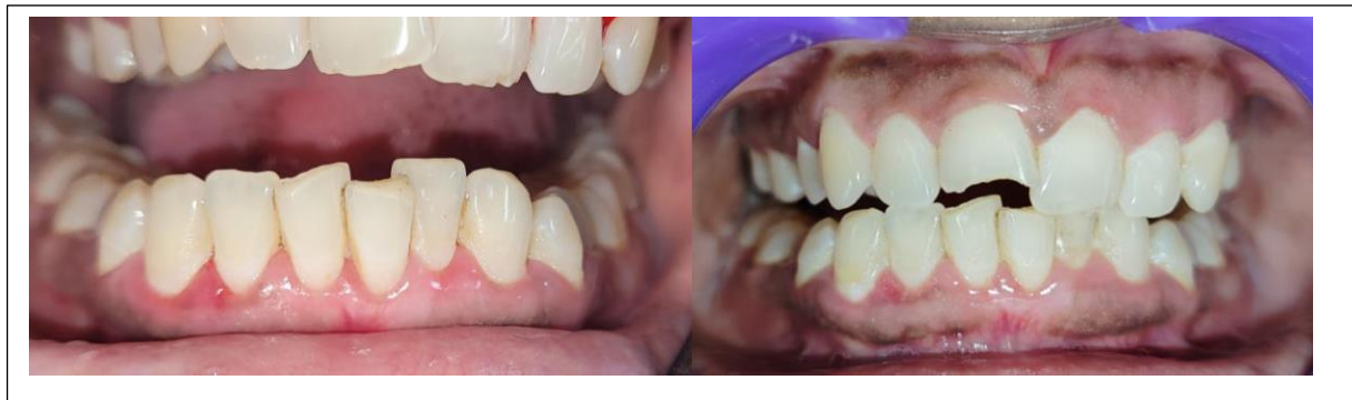
Figure 5:- Follow up 3 months and 1 year respectively.

Correlating history, clinical examination, and investigations, final diagnosis of combined gingival enlargement (immunosuppressant induced and inflammatory) was made. The patient was followed up for more than a year. The physician has stopped immunosuppressant therapy 3 months after the surgical correction. A follow up after 1 year shows successful result and the patient is well satisfied with the treatment.