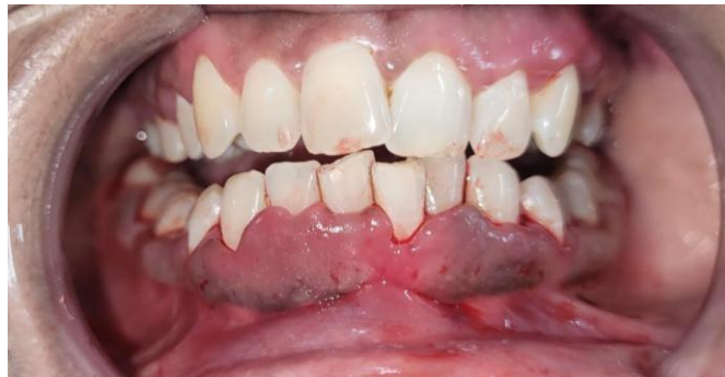
Figure 2:- Bleeding points are marked using pocket marker.