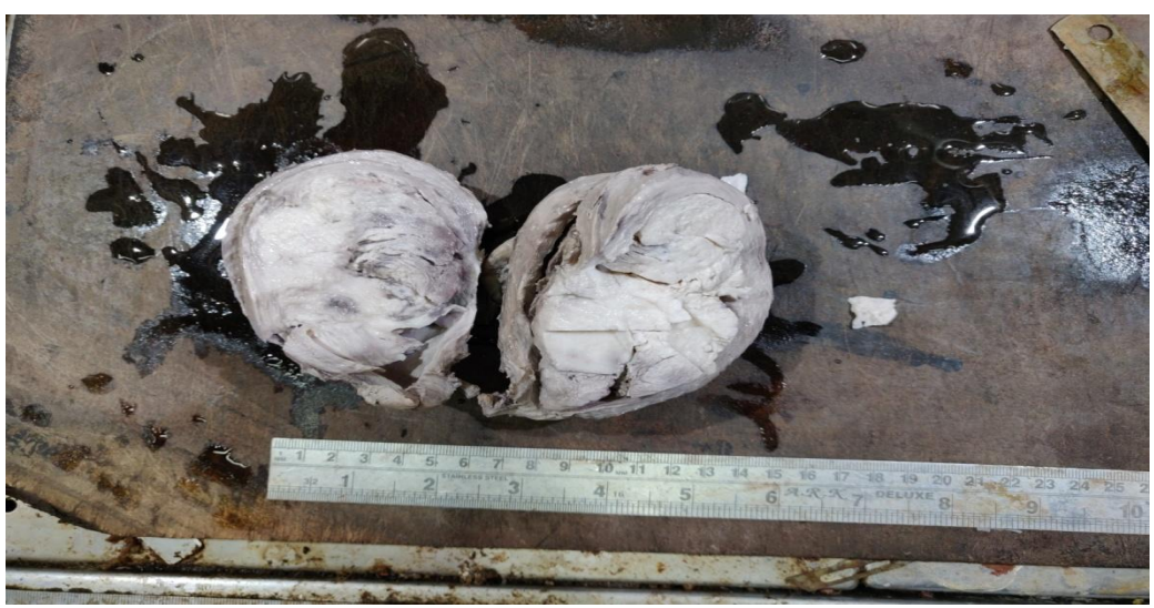
Polypoid mass in uterine cavity

Uterus cervix with bilateral adnexa. Cervix was unremarkable. Endometrial canal dilated filled with polypoidal mass measuring 8x6x5cm. On serial sectioning cut surface of mass was grey white variegated with areas of calcification and necrosis. Tumor had gritty sensation while cutting. Mass was attached to the anterior wall of body of uterus and extending into myometrium. Mass was extending into the cervical canal. Both ovary and fallopian tubes are unremarkable grossly.