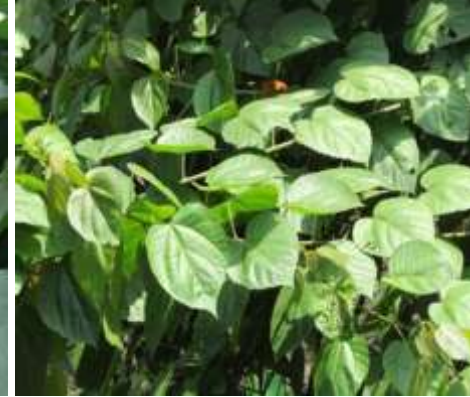
Costus speciosus (J.Koenig) Sm.