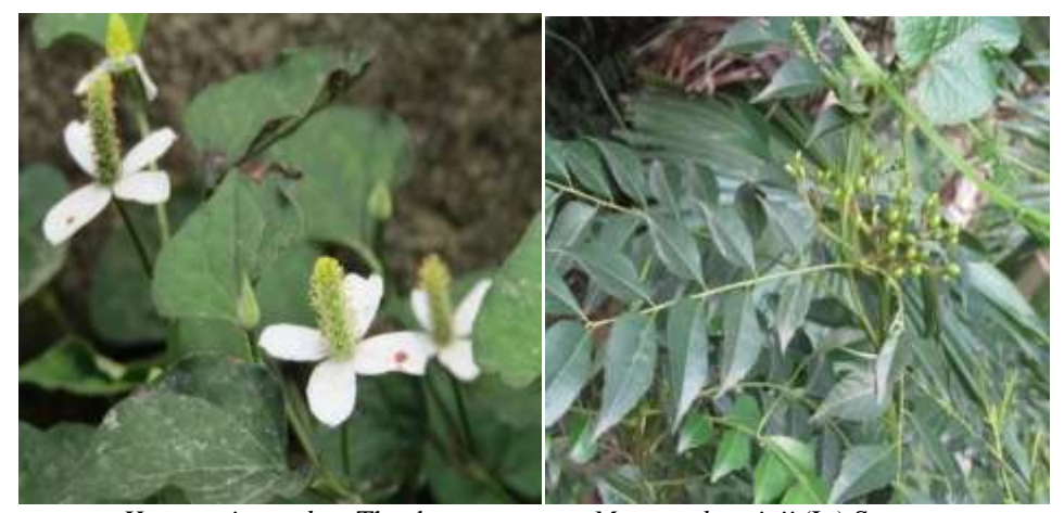
Houttuynia cordata Thunb.