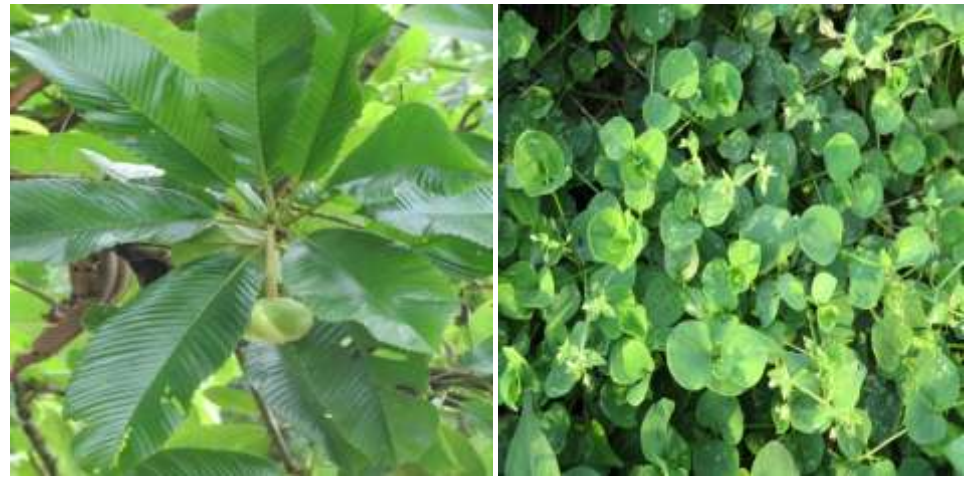
Dillenia indica L.