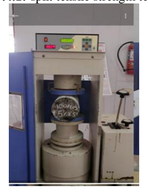
Fig 3.4.1:-split tensile strength testing