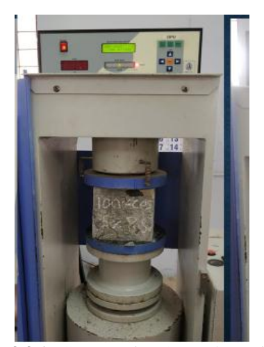
Fig 3.3.1:-Compressive Strength Testing