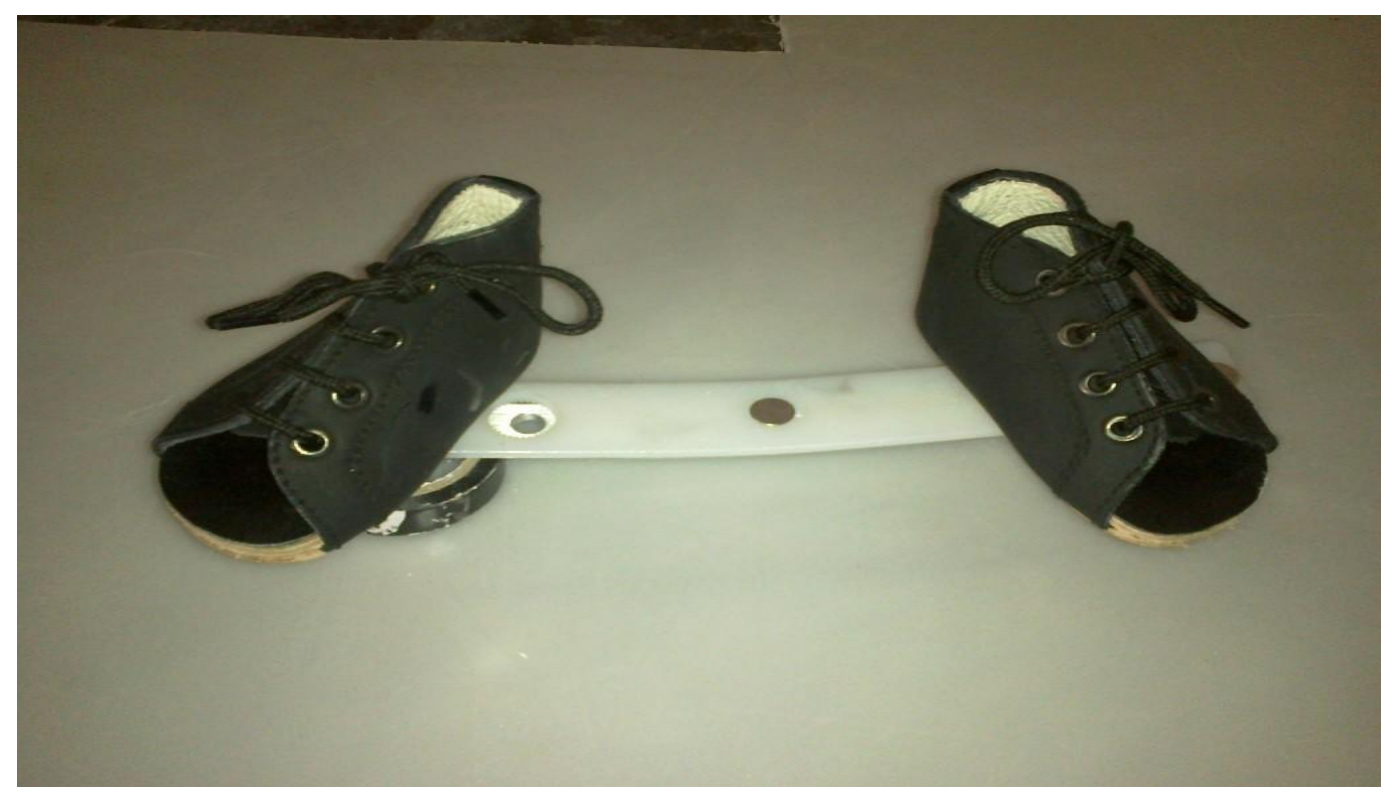
Brace was applied for 23 hours for first 3 months. Following initial 3 months in brace, weaning from brace was done with 2 hours of bracing time reduced every month until night time bracing (12 hours) was started and was advised to be kept for 3-4 years.