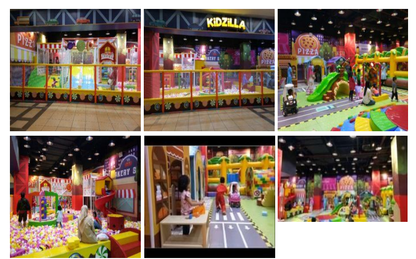
Figure 27: Internal Facilities of KidZilla – BG Junction

There are various kinds of games in Kidzilla. Starting from role playing (roleplay), bouncy castle, slide, swing, trampoline, bathing ball, toy cars, bicycles, and others. To play the role, the child can choose whether to become a bakery owner, bank teller, pizza seller, mechanic etc.