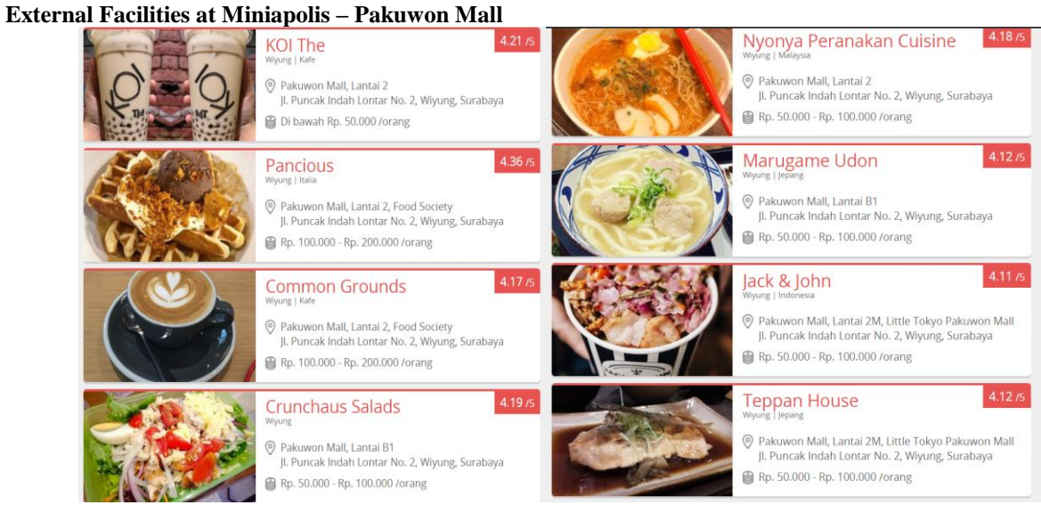
Figure 25:- Dining Places