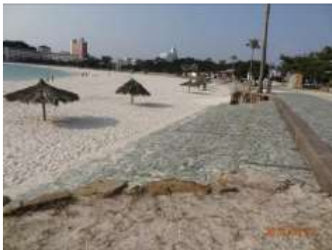
Fig. 20:- Respect for landform, creation of a distinctive sense of place, the overall permeability and legibility of the layout