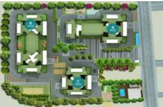
Fig. 16:- Green is not only the most extensive and frequently used part of living environment, but also the closest natural environment and having the greatest influence on residents in urban landscape.