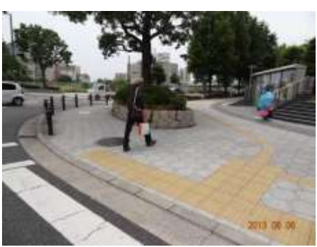
Fig. 12:- The neighborhood park is intended to provide an outdoor living room for the neighborhood. Source: author (2013) Osaka, Japan