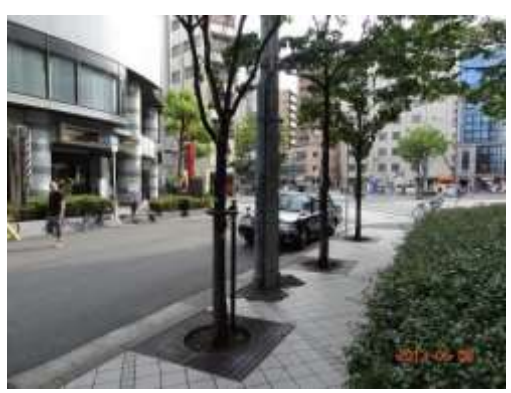
Fig. 17:- A Street has important public realm functions beyond the movement of traffic. These functions include place-making, providing access to buildings, parking, and the location of public utilities and public lighting. Source: author (2013) Osaka, Japan