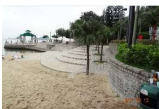
Fig. 19:- The development respects the surrounding context and is appropriate to the character and topography of the site in terms of layout, scale, proportions, massing and appearance of buildings, structures and landscaped and hard surfaced areas;