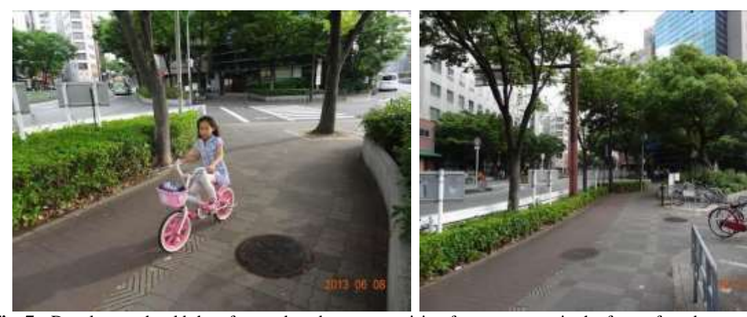
Fig. 7:- Developers should therefore make adequate provision for open space in the form of gardens, parks, urban plazas, patios, balconies or terraces, depending on the characteristics of the development proposed and the surrounding context.

indoor environment. It is a biological environment centered about human beings and composed of the natural environment, artificial environment and social environment (Fig. 7).