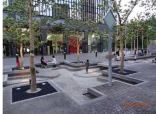
Fig. 9:- The necessary activity includes activities which are involuntary such as work, studying, shopping, waiting, etc. In other words, people are more or less taking part in the activities being as part of daily life Source: author (2013) Osaka, Japan