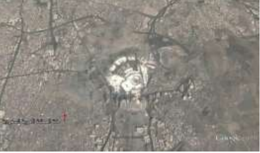
Fig. 1:- Unfortunately, the overall Arial view of the Holy City of Makkah, reveal the scarcity of all kinds of urban outdoor open spaces. No heretical green net of recreational areas, no adequate urban plazas, no residential gardens,