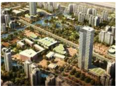
Fig. 13:- There could appropriately increase the amount of green space, which could create a pleasant green environment and effectively improve micro-climate as well, for example ,Qizhong Maqiao Large-scale residential landscape design that has diverse requirements,