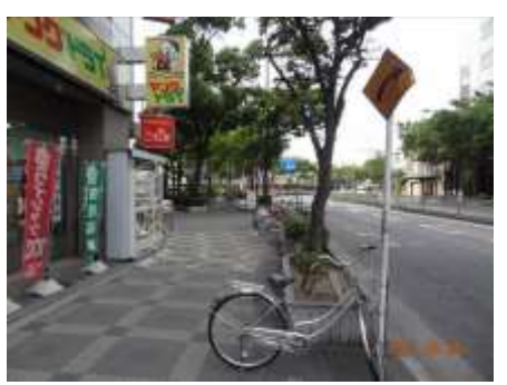
Fig. 18:- Most residential streets – as witnessed by many existing streets in cities and towns – can successfully combine low to medium traffic movements with a pleasant residential setting, including on-street parking where street widths permit.