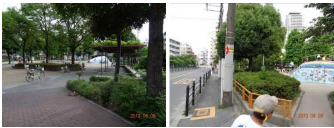
Fig. 8:- Residential landscape is not only providing residents a vision, but also, at the same time functioning well for residents.