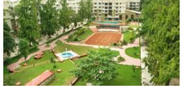
Fig. 3:- Creating and maintaining aesthetically appealing, functionally efficient and healthy environment