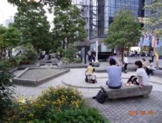
Fig. 10:- Spontaneous activity space is put forward from spontaneous activities and means generated activities when people want to participate, and when the time and place is possible. Such activities include walking, playing with dog and a breath of fresh air, morning exercises and watching interesting things and so on.