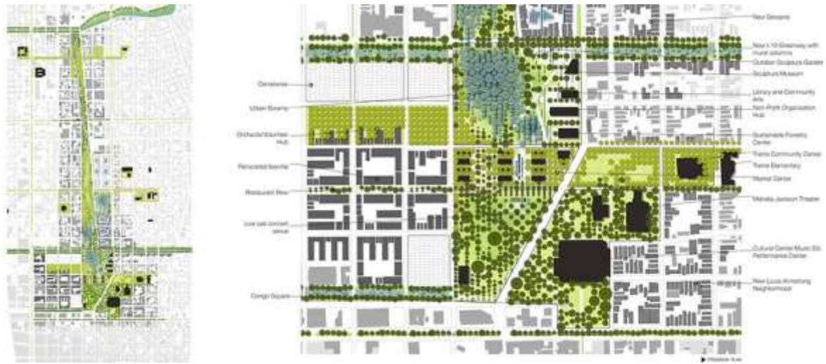
Fig. 14:- The outdoor environment of inhabitation is created by variety kinds of space, green, landscape pieces and service facilities. Residential landscape is the important space for people's daily life, that support a denser residential/commercial organization.