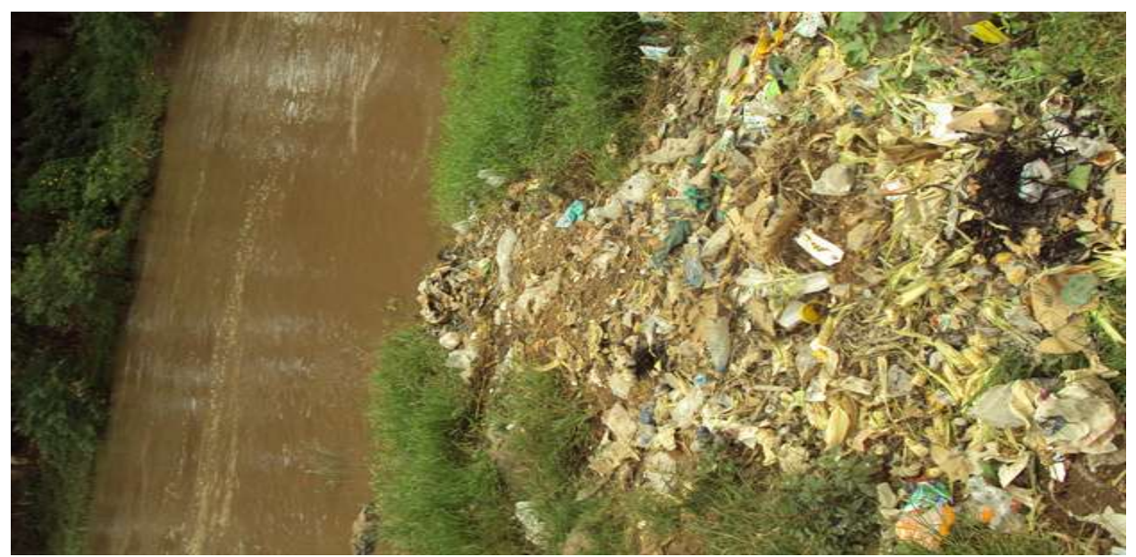
Plate 2:- Solid waste dumped adjacent to River Migori

The study established that the public/residents of such urban areas are to blame partially for not having environment at heart. The major problem was found to be irresponsibility of the city or town council in rendering their services of waste collection.