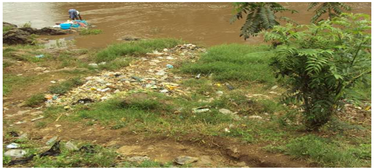
Plate 1:- Direct washing and dumping of waste into the river

In Migori County (Kenya) for instance, poor solid waste management is also evident. River Migori that passes directly within Migori town is being degraded. A lot of residential structures have been erected along the river and the residents of such places not only wash and bathe directly into the river but also dump waste (plate 1).