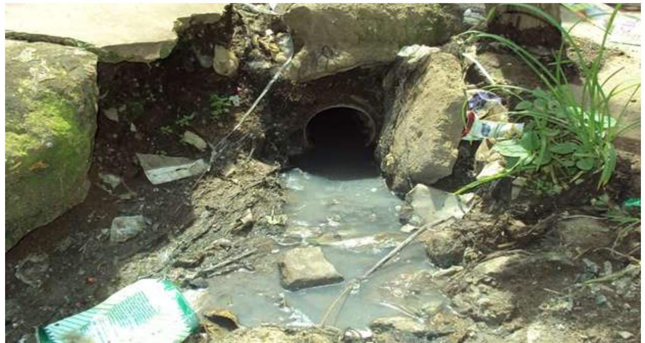
Plate 3:- Open sewer line in Migori town

Industries also emit fumes into the air. Together with the ones that come from vehicles and other machinery used in urban centres, air quality is affected. The study found that in Kenya most of industries have not put in place environmental safety measures like installation of carbon filters in factories. This may at times lead to emission of substances like sulphur dioxide which is a contributing factor to acid rain. These together reach the water bodies direct and even through run off thereby affecting the quality of surface water.