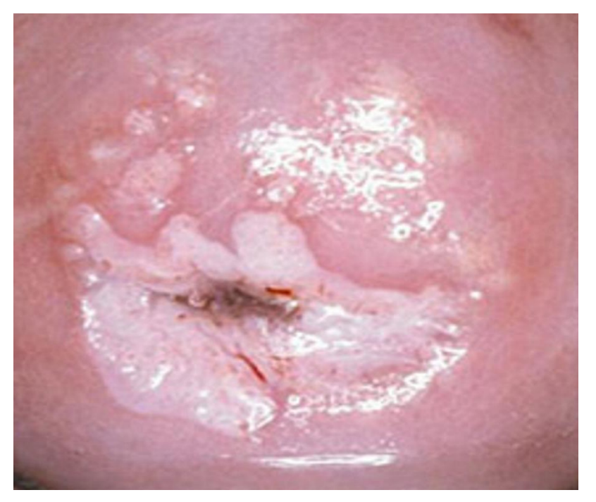
Fig 2: Patient with Colposcopy showed HSIL.