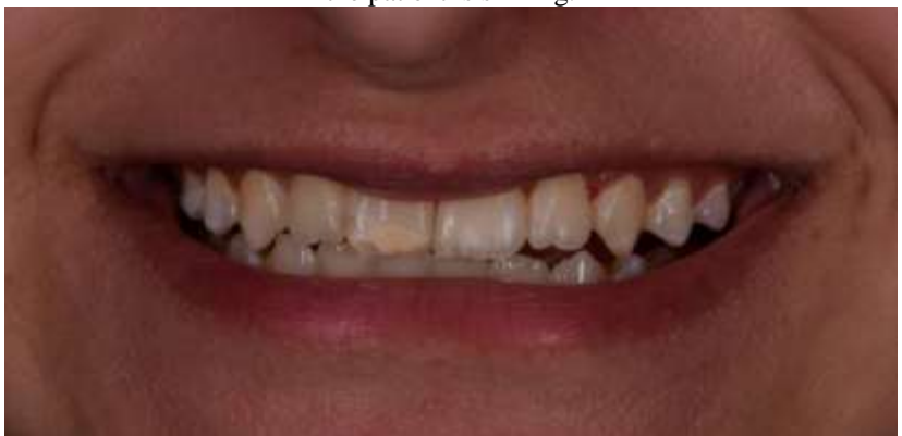
Img. 2 – Even with using of check and lip retractor upper soft tissue amount appearing in photography look smaller than lower arch soft tissues, fair oral hygiene, teeth discoloration specially in the incisal third of upper central incisors, unilateral cross bite in left canine and first premolar, deviation of mid line and upper big frenulum.

Img. 1 - Initial situation. Note that low smile line, teeth color change and incisal edge asymmetries are visible while the patient is smiling.