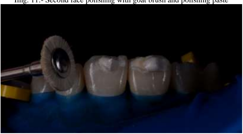
Img. 11:- Second face polishing with goat brush and polishing paste

Img. 12 –The first step is erosion infiltration to treat the white spots and/or discoloration. The following step consists of accessing the hypomineralized fluorosis lesions. This requires the elimination of the hypermineralized enamel on the surfaces of the lesions. Therefore, the erosion is performed using a gel of 15% hydrochloric acid (Icon-Etch DMG) for 120 seconds.