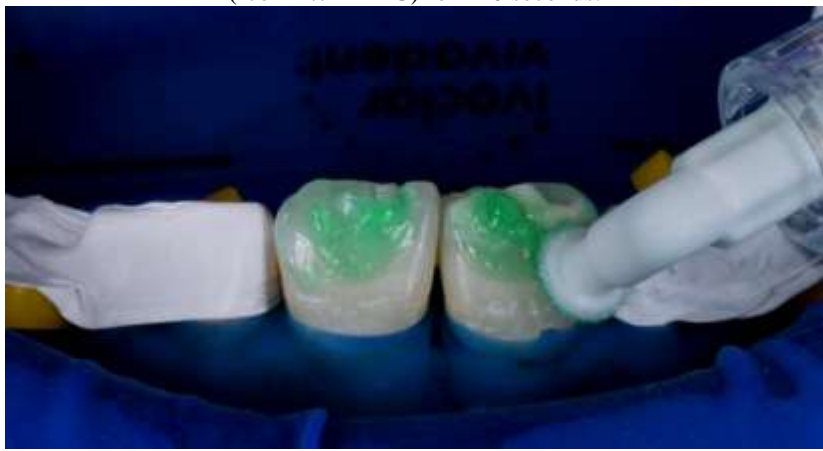
Img. 13 –In order to avoid uneven erosion, which could be caused, for example, by bubbles forming in the gel, the surface is mechanically rubbed using a microbrush.

Img. 12 –The first step is erosion infiltration to treat the white spots and/or discoloration. The following step consists of accessing the hypomineralized fluorosis lesions. This requires the elimination of the hypermineralized enamel on the surfaces of the lesions. Therefore, the erosion is performed using a gel of 15% hydrochloric acid (Icon-Etch DMG) for 120 seconds.