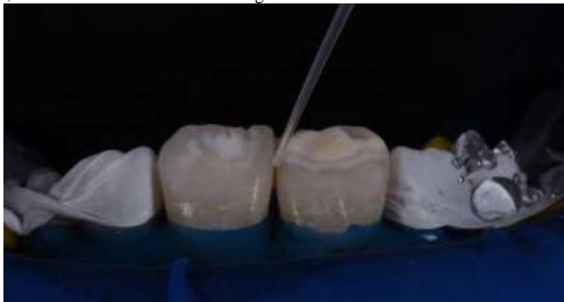
Img. 15 - With the third syringe we can apply the resin, gently moving the tip to facilitate the resin penetration.

Img. 14 - Dehydration with ICON DRY. Once the enamel has been eroded, the water contained in the micropores of the fluorosis lesions must be eliminated before the resin infiltration is carried out. In fact, the infiltrating resin (Icon-Infiltrant) is a matrix based on hydrophobic methacrylate resin (TEGDMA): for this reason, the lesions must be desiccated beforehand. This dehydration is accomplished through the application of a solution of 99% ethanol (Icon-Dry), for 30 seconds, on the surface of the lesions using a flattened needle.