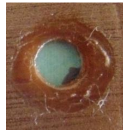
Fig 2:- Zone of inhibition for platelet-rich plasma against A.actinomycetemcomitans at 7 th day: