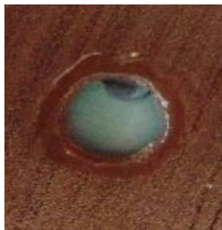
Fig 1:- Zone of inhibition for platelet-rich plasma against A.actinomycetemcomitans at 2 nd day.

PRP contains a large number of platelets as well as a high concentration of leukocytes, which has been reported to be two to four times greater in PRP than in the whole blood. Among these leukocytes, neutrophils are known for their host defense actions against bacteria and fungi through the actions of myeloperoxidase, which presents in neutrophilic granulocytes; lymphocytes produce immunocompetent cells and one of their representative functions is found in immunologic defense; monocytes (precursors of macrophages) produce cytokines and chemotactic factors that participate in inflammation. Therefore, the concentrated leukocytes in PRP may enable PRP to play an important role in the immune defense against bacterial infection. 4