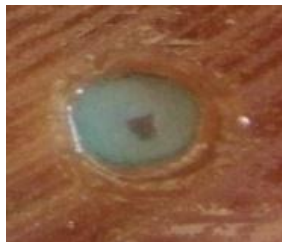
Fig 5:- Zone of inhibition for platelet-rich plasma in against P. gingivalis at 2 nd day.