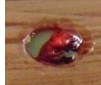
Fig 8:- Zone of inhibition for platelet-rich fibrin in against P. gingivalis at 7 th day.