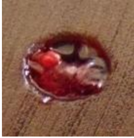
Fig 3:- Zone of inhibition for platelet-rich fibrin groups against A.actinomyetemcomitans at 2 nd day.