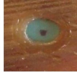
Fig 6:- Zone of inhibition for platelet-rich plasma in against P. gingivalis at 7 th day.