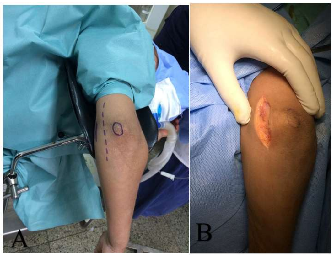
Figure 1:- A: shows lateral decubitus position of the patient. B: shows the incision midway between the olecranon and medial epicondyle.

A longitudinal skin incision about 4 cm long is made midway between the medial epicondyle and tip of olecranon, in the swollen injured elbow, the skin incision is made medial to the olecranon as the only landmark.(Fig.1b). and if the fracture is associated with dislocation closed reduction is mandatory before exposure.