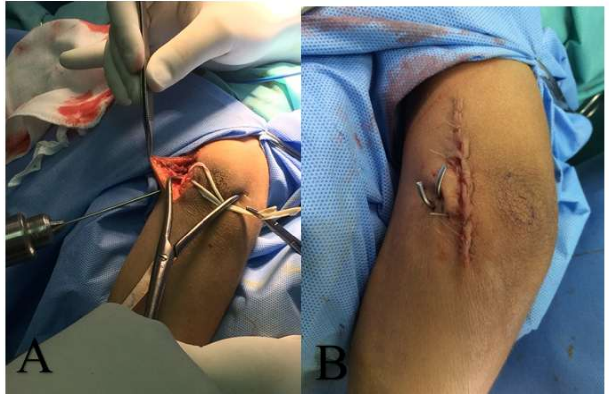
Figure 3 :- A: Shows percutaneous insertion of the K. wires after temporary holding by reduction forceps. B: Skin closure using interrupted sutures after fixation and assurance using image intensifier.

Care is taken to avoid drilling into the olecranon fossa. Anteroposterior and lateral views are obtained to assure proper reduction of medial epicondyle and optimal placement of K. wires or screws and washers. The tourniquet is released and all bleeding spots is controlled. Closure of subcutaneous layer using absorbable sutures. The skin is closed with interrupted monocryl or nylon suture. (Fig.3b).