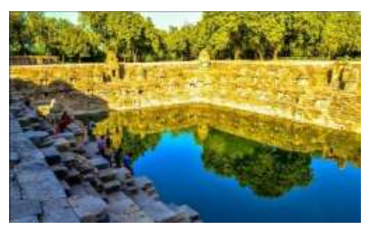
Figure 5: The Kund of the Sun Temple, Modhera, Ahmedabad, Gujarat, India (http://www.inditales.com/architecture-of-sun-temple-modhera)

As one move towards the temple along the axis, the foreground of the tank begins to register the visual frame. The kinesthetic sense can be experienced while ablution. The sound of the water is the auditory experience and the olfactory sense is triggered by the smell sense. This confluence is a unique experience, however, the absence of water in a tank these days still forces the observer to hypothetically experience the sound of the water, sometimes silent, the other time with the noise of imaginary devotees inside it. One can imagine the beautiful mirror image of the shikhara that must have once been reflected in the tank water. The tank further emphasizes the need to reach the divine after the ablution. The enclosure of the surrounding steps on all sides leaves the only temple in vision. Thus, the tank contributes in bringing about the confluences of visual, auditory, and the kinesthetic senses (figure 5).