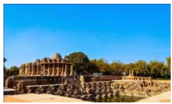
Figure 2:- The Perspective View of the Sun Temple, Modhera, Ahmedabad, Gujarat, India (http://www.inditales.com/architecture-of-sun-temple-modhera)

The place welcomes us with a visually appealing tank and the gateway standing gracefully before the backdrop of green trees. Views from across the tank, with a shrine in the foreground, against the backdrop of the steps and the temple, forces to feel the openness of the space. The freshness of the water notices the relationship between the self and the surrounding nature. It brings about the confluence of fire (sun rays) and water for the human body to experience polarization (touch sense) (figure 2).