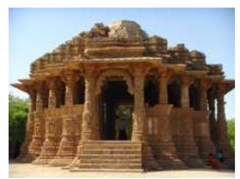
Figure 6:- The Temple of the Sun Temple, Modhera, Ahmedabad, Gujarat, India (http://www.inditales.com/architecture-of-sun-temple-modhera)

This is a beautiful example which serves an architectural palette for the sensorial experience by playing with the usage of the site in terms of placement, orientation and the creation of levels to the proportions of the super-structure. The massing and the kind of entablature, the carvings, and the overlays of symbols are all designed with expert sensitivity and knowledge to have holistic architectural experience (figure 6). This structure till date fulfills its purpose of construction.