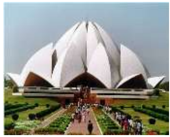
Figure 8: The Avenue Towards the Structure of the Lotus Temple, New Delhi, India (http://www.google.co.in/lotus+temple&source)

The clues from movement, inherent to space, are revealed sequentially. The time gap required for the deconditioning of the previous and the pre-conditioning of the next is taken care of while designing spaces sequentially. This gradual unfolding of spaces creates a sense of curiosity within the visitors and involves them in the process to experience through human senses. The walkways with beautiful curved balustrades, bridges, and stairs, surround the nine pools representing the floating leaves of the lotus. Apart from serving an aesthetic function, the pools also help to have the pleasing and soothing experience of the breeze (figure 8).