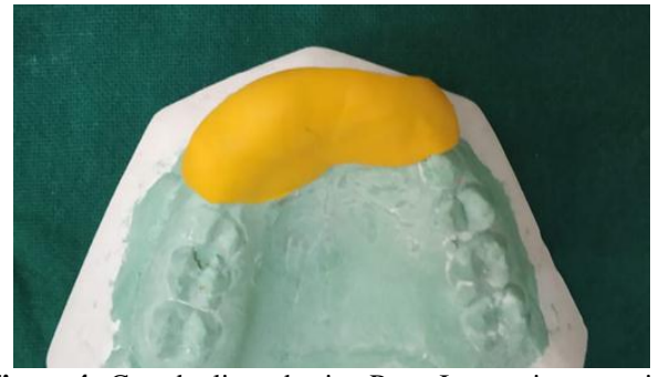
Figure 4:-Cast duplicated using Putty Impression material