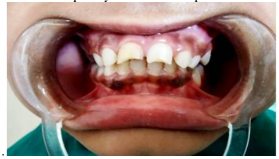
Figure 1:-Pre-operative view

impressions of both the arches were made using alginate impression material (figure 2), study models were made in dental stone and mock preparation of the lost tooth structure with modeling wax was done and further checked for occlusal interference (figure 3). Once the crown build up was done, the cast was duplicated by using template putty impression material (figure 4). Labial surface of the putty template was removed up to middle third of the crown with BP blade, to aid in the reconstruction of the lost tooth structure (figure 5). A clinical try – in of the template was done to ensure adequate fit. Finally appropriate shade selection of composite material was done followed by crown build up to restore the fractured teeth quickly with minimal post –restoration finishing (figure 6).